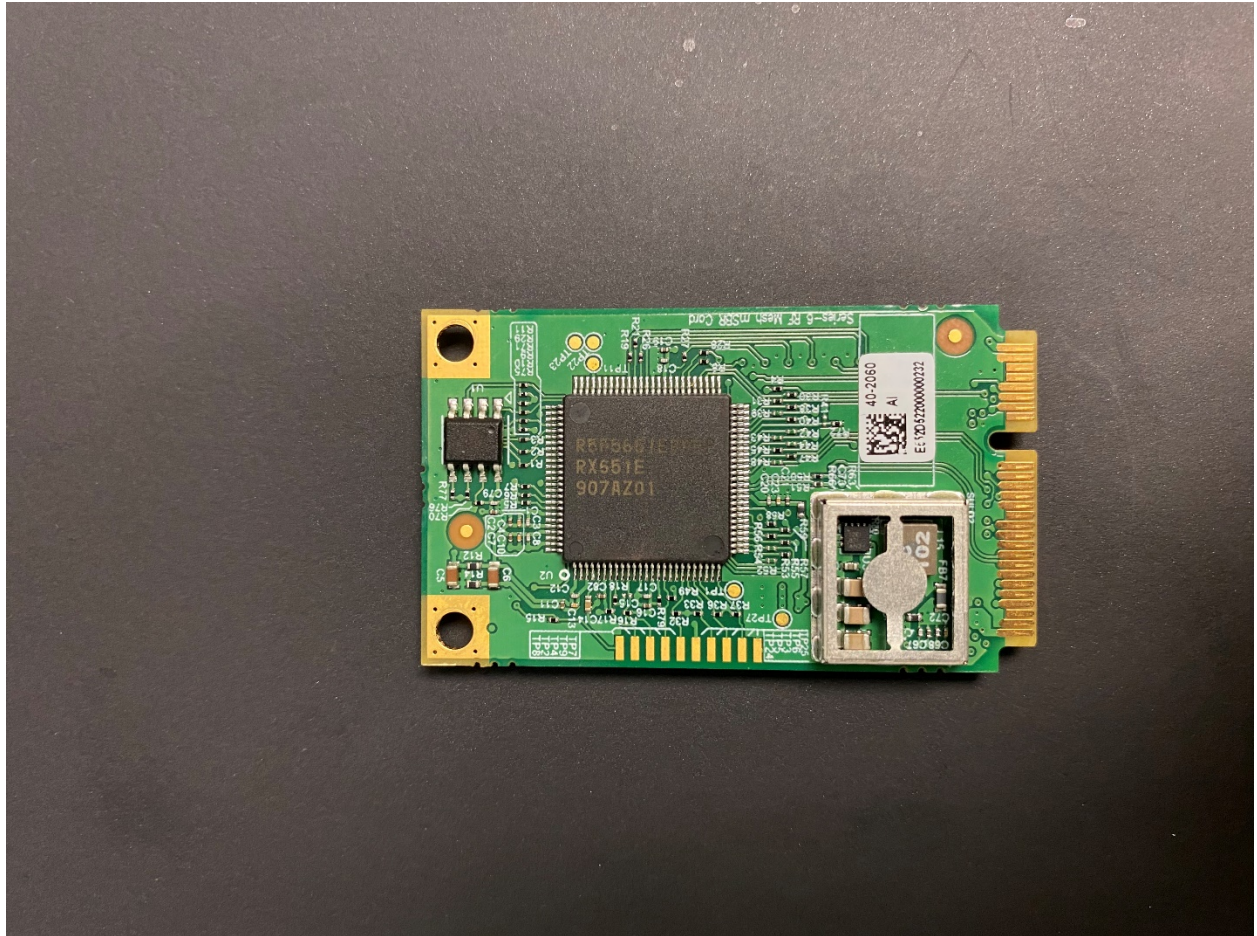
Figure 4: RF Board No Shields Back View