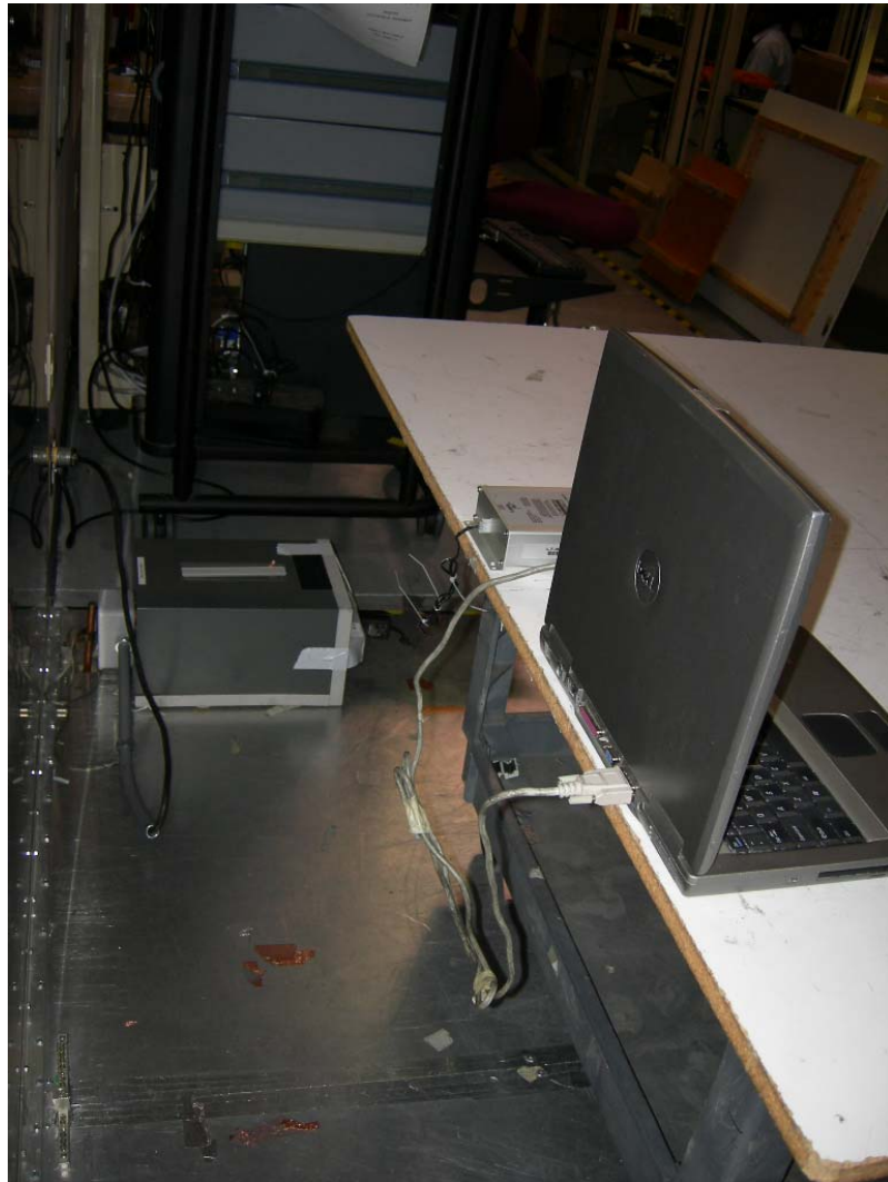
Figure 4: Conducted Emissions – Test Setup Photo