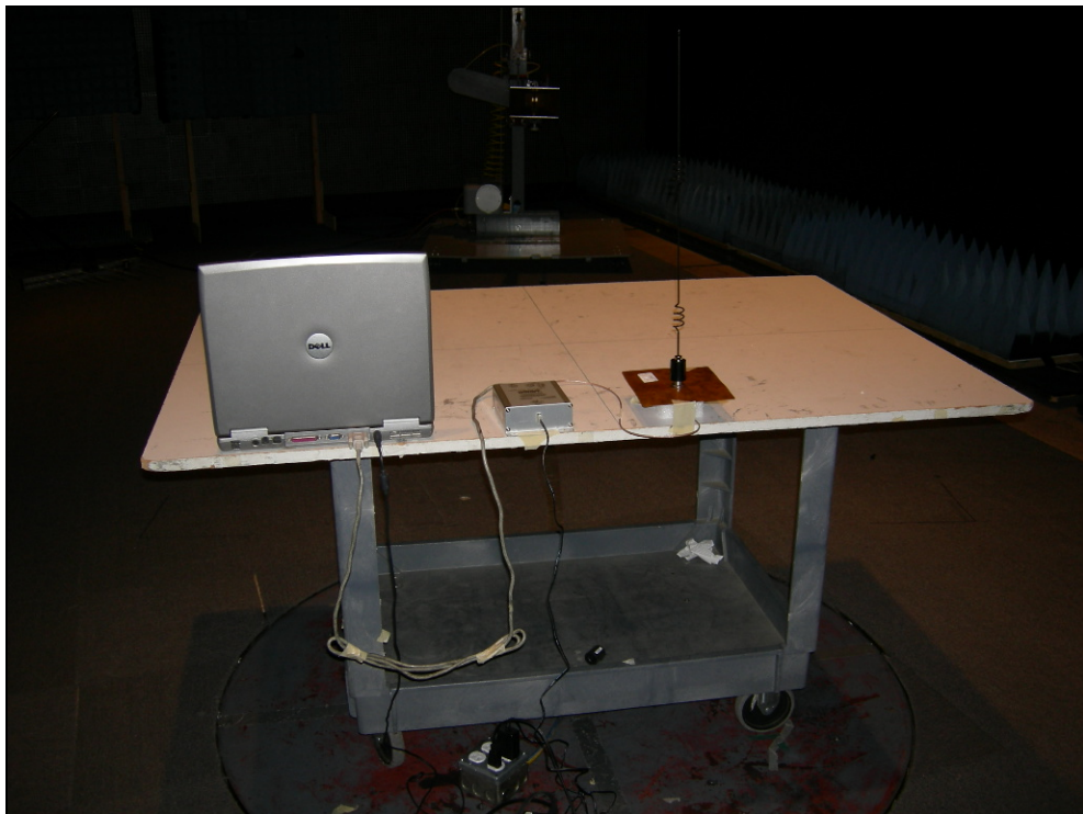
Figure 2: Radiated Emissions – Test Setup Photo