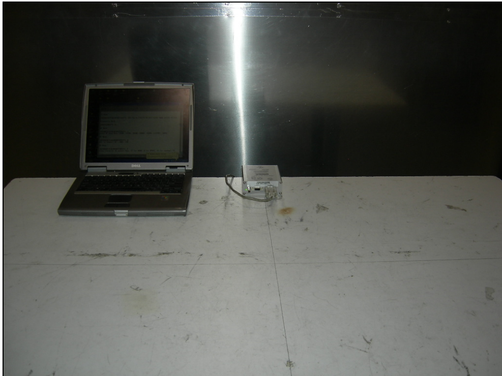
Figure 3: Conducted Emissions – Test Setup Photo