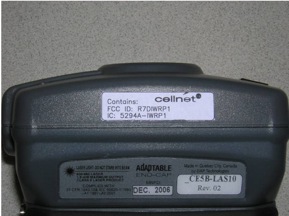
Figure 3: Label Sample – Host