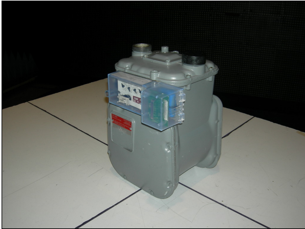
Figure 3: Radiated Emissions