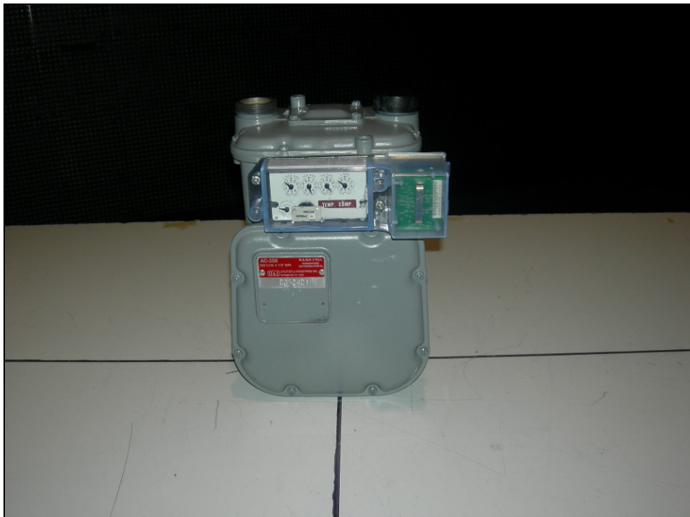
Figure 2: Radiated Emissions