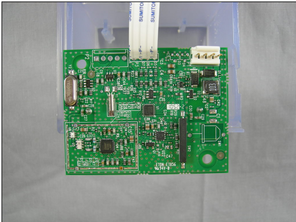
Figure 2: PCB - Front