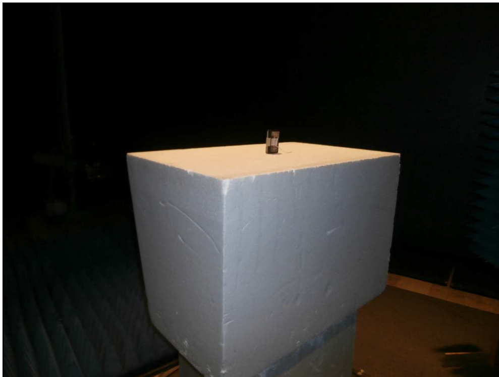
Figure 2: Radiated Emissions