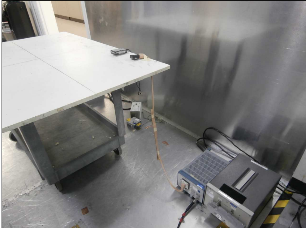
Figure 4: Conducted Emissions