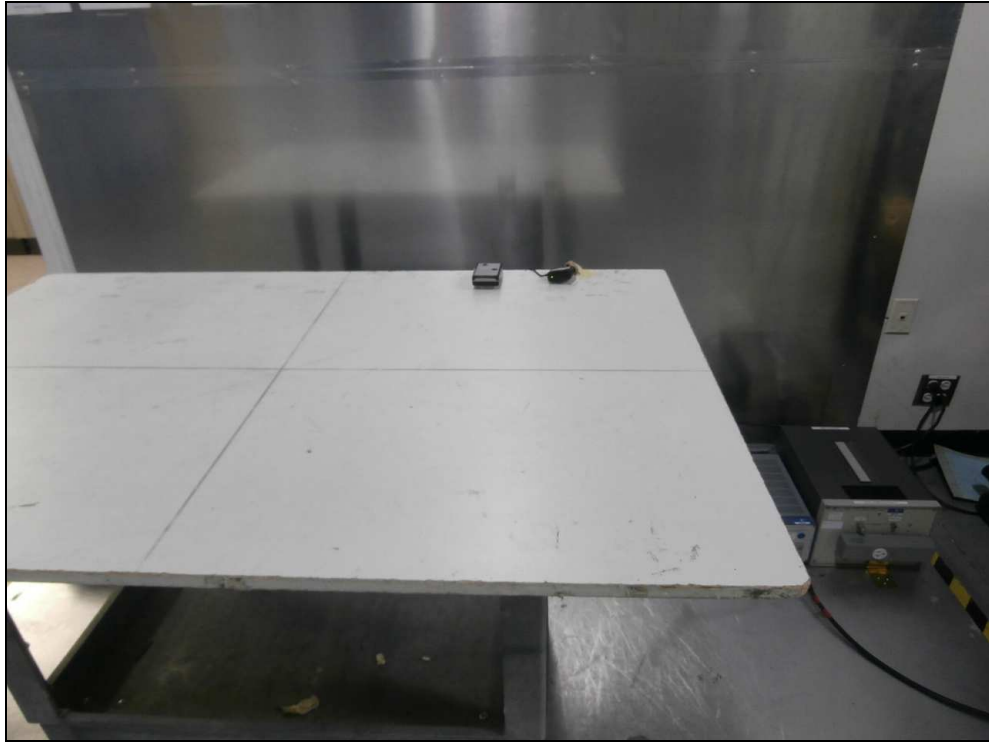
Figure 3: Conducted Emissions