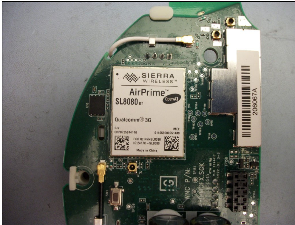
Figure 3: Sample Label and Location – Cellular Radio