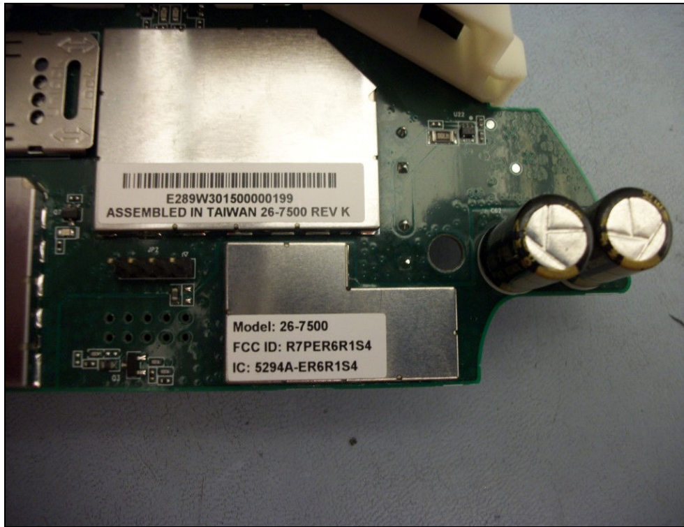
Figure 1: Sample Label and Location