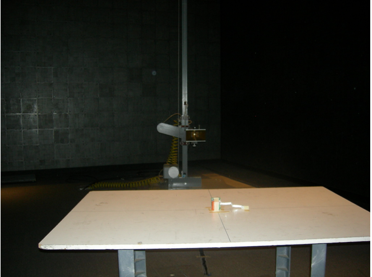
Figure 2: Radiated Emissions