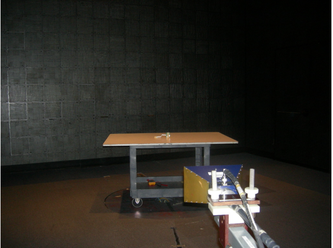
Figure 3: Radiated Emissions