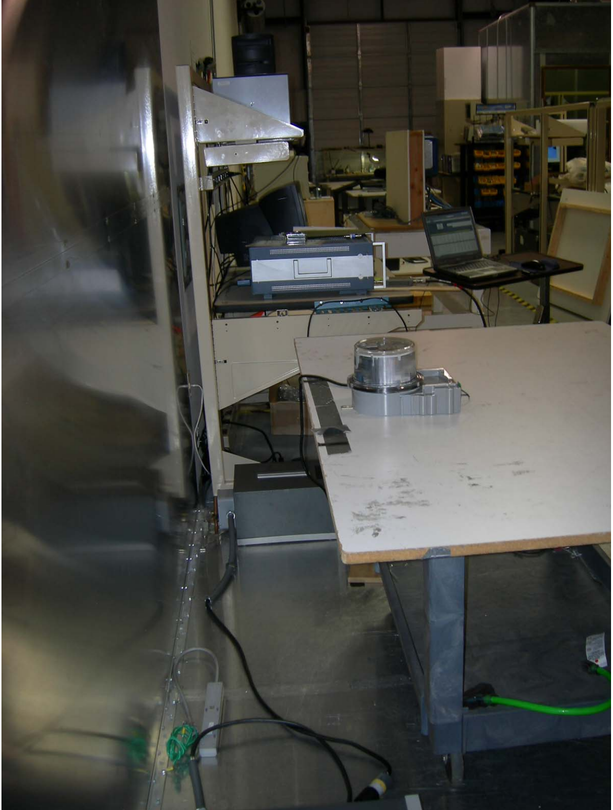
Figure 6: Test Setup - Conducted Emissions