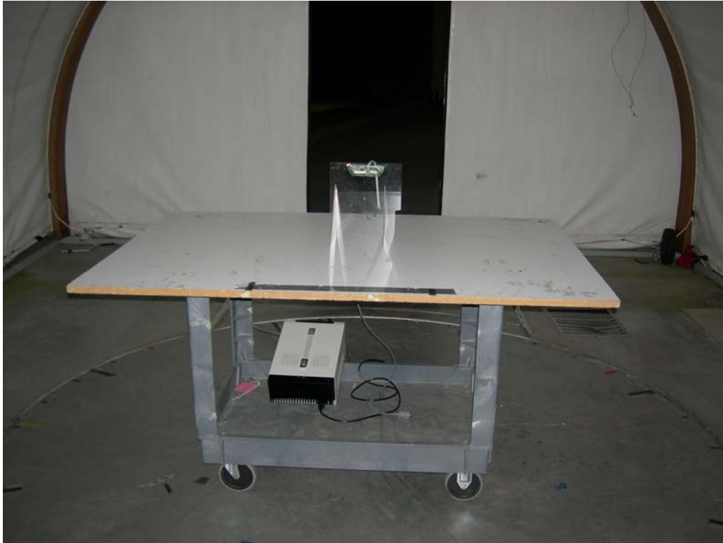
Figure 4: Test Setup - Radiated Emissions – Unintentional