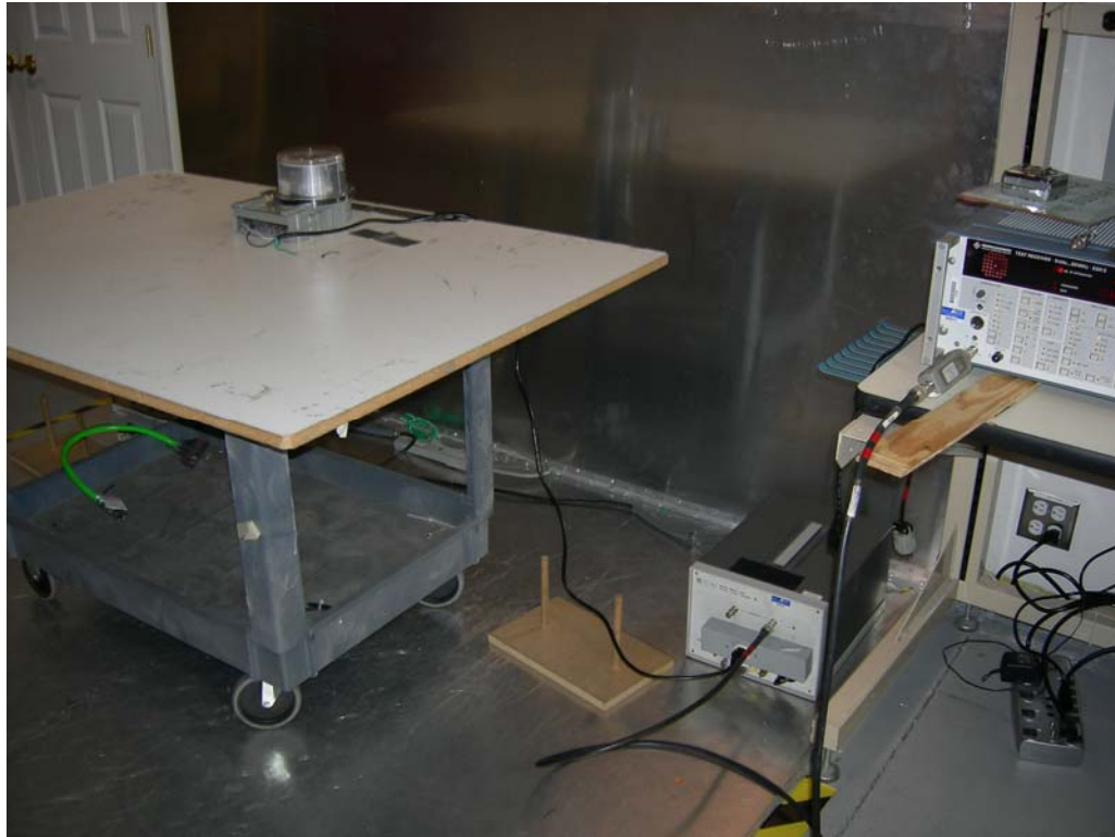
Figure 5: Test Setup - Conducted Emissions