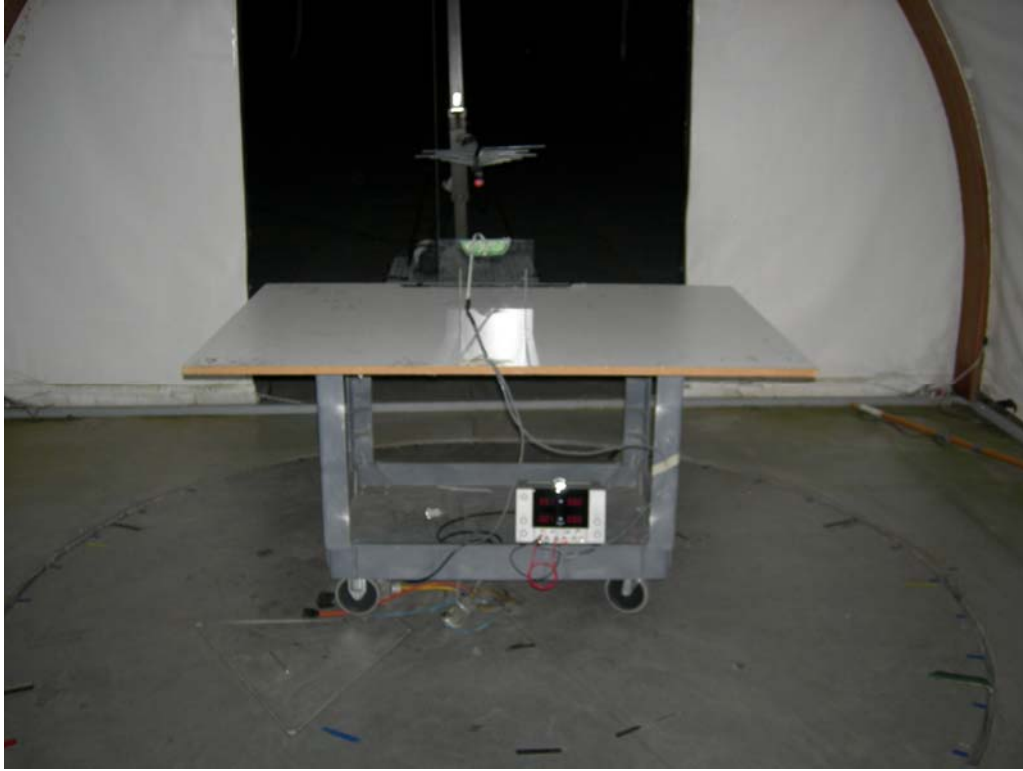
Figure 3: Test Setup - Radiated Emissions – Unintentional