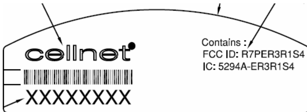
Figure 3 Label Information – Host Sample Label