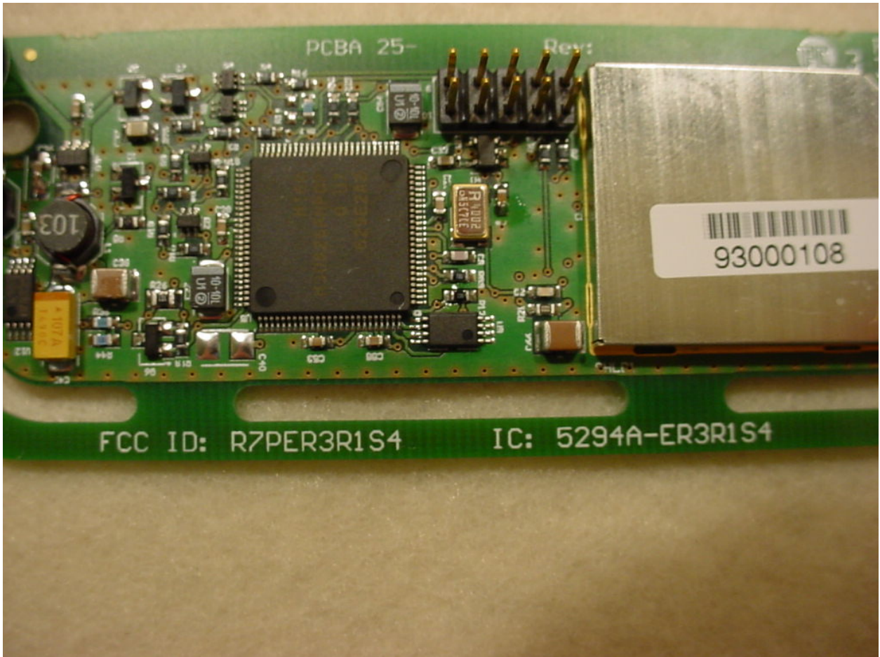
Figure 1: Label Information: Module Label and Location