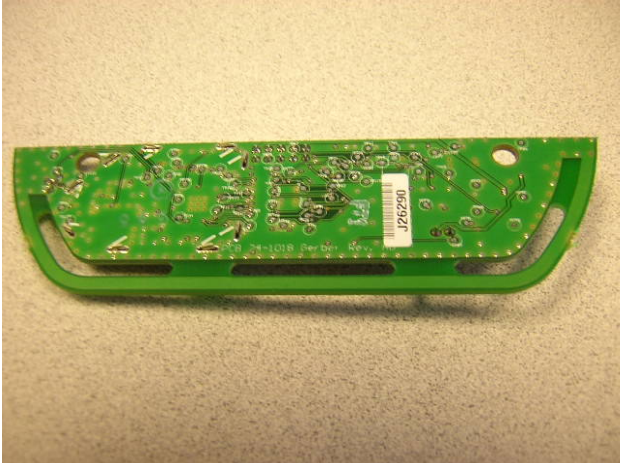
Figure 3: External – PCB Back