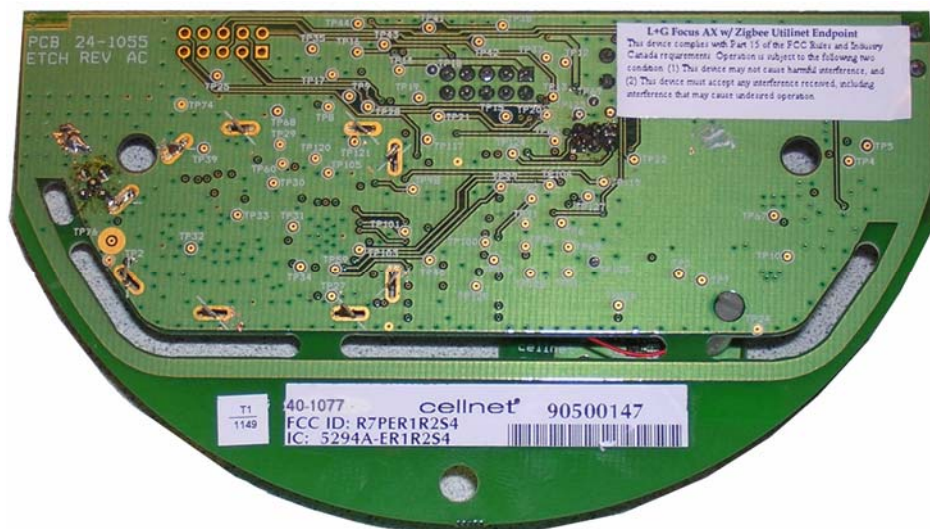
Figure 2: Label Locations