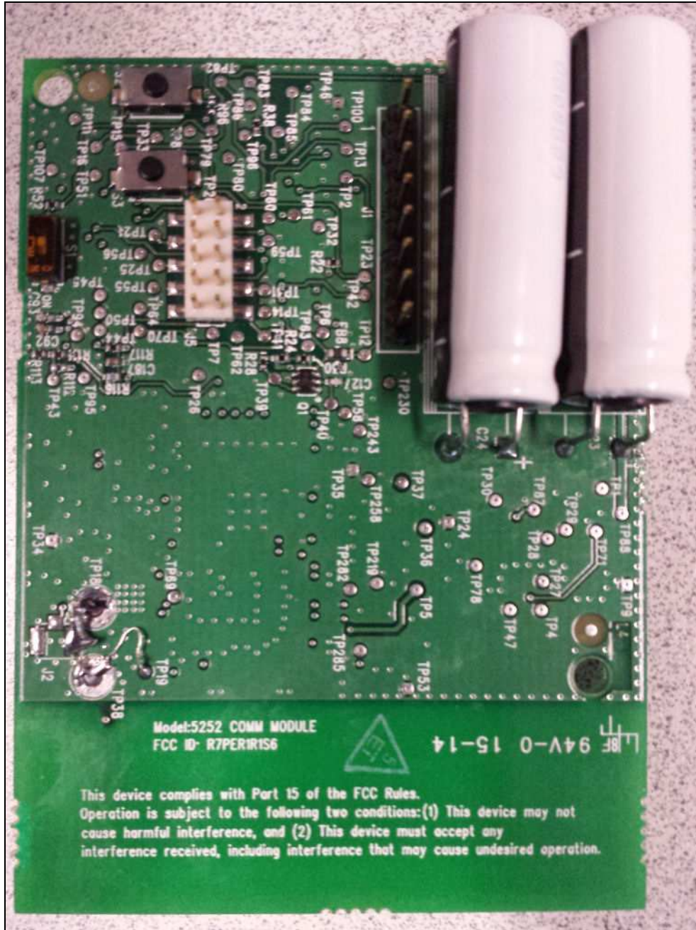
Figure 1: Sample Label and Location