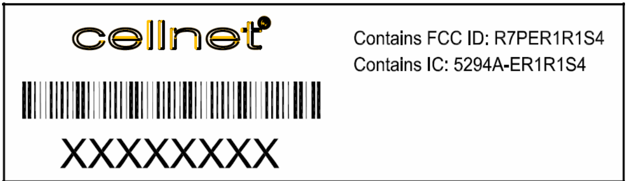
Figure 3: Label Information – Host Sample Label