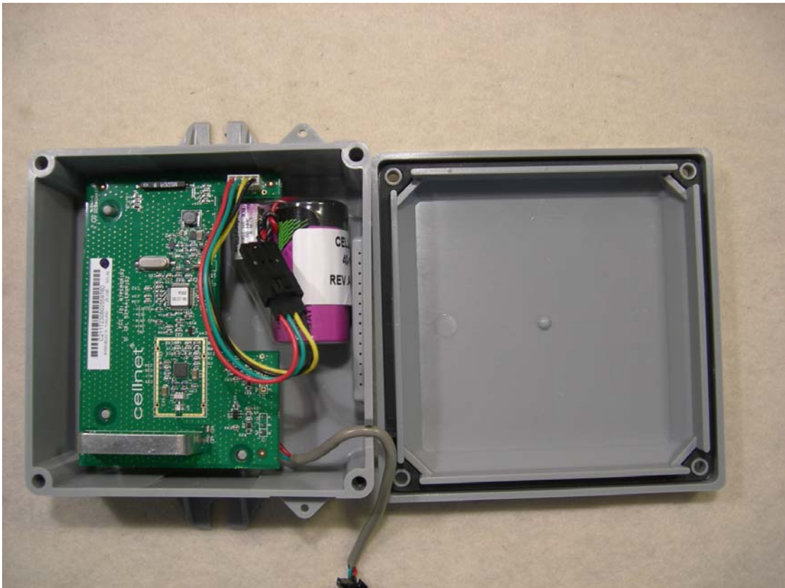
Figure 1: Internal - Assembled View