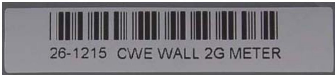
Figure 2: Sample Label (Model Designation)