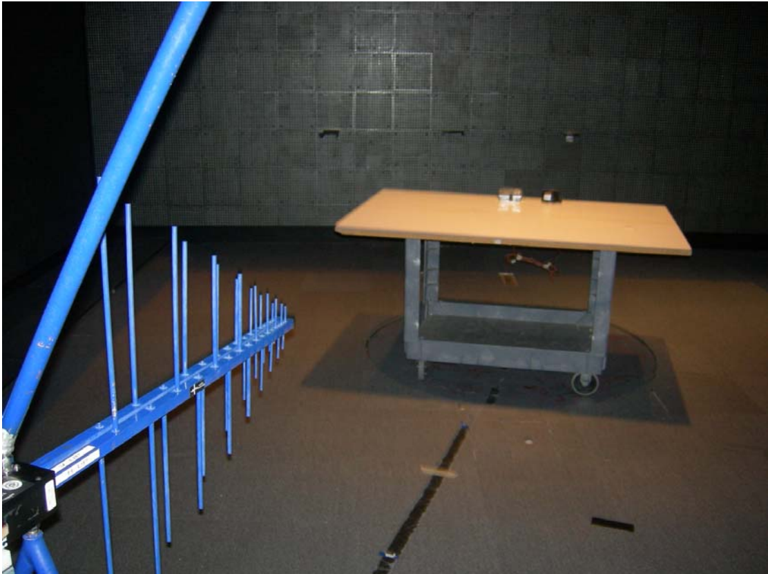
Figure3: Unintentional Radiated Emissions