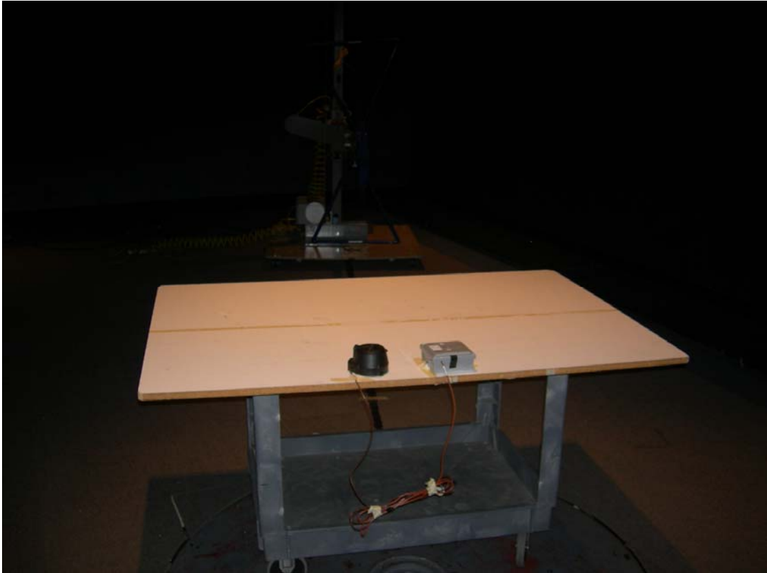
Figure 4: Unintentional Radiated Emissions