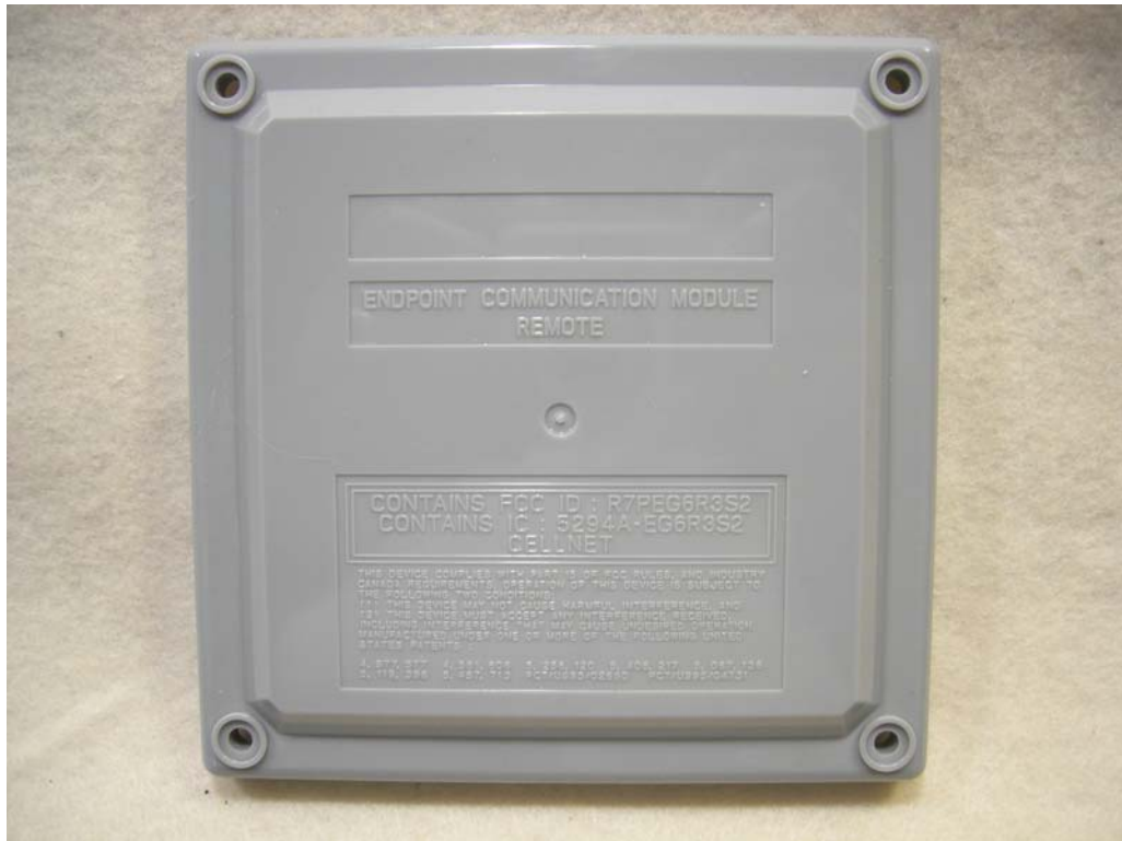
Figure 3: Host Label