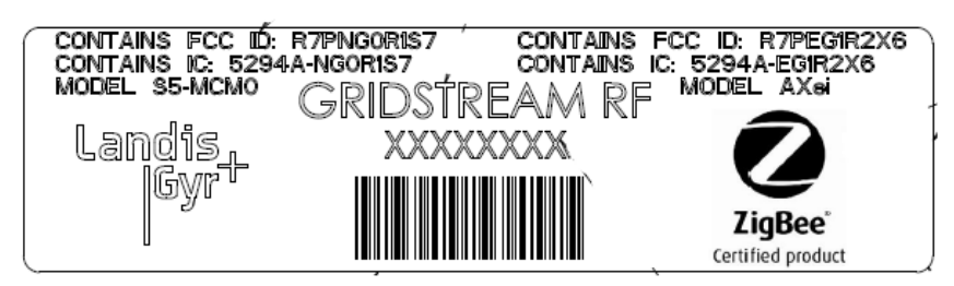
Figure 4. AXei meter label

The figure below demonstrates a label that complies to the labeling requirement for a host.