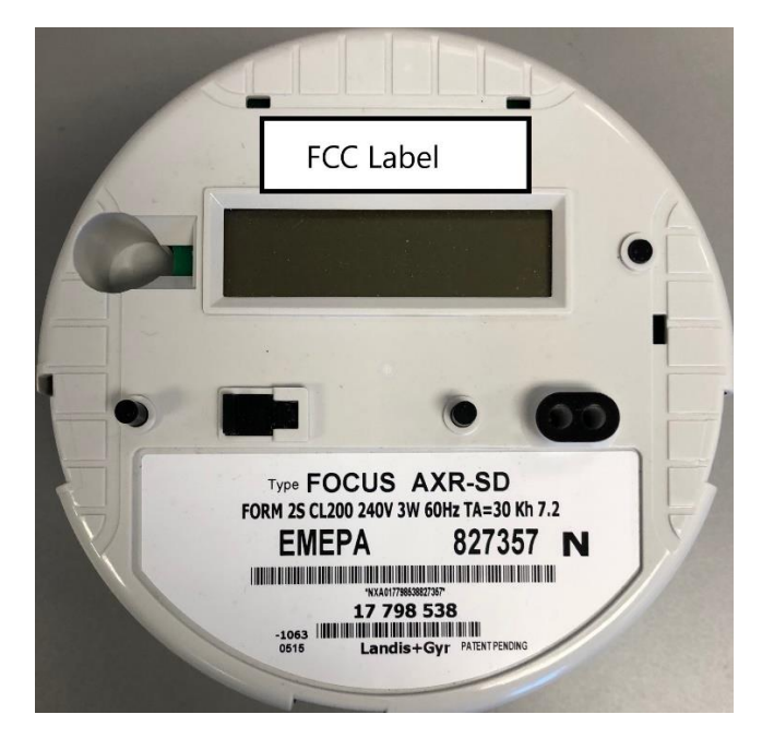
Figure 3. Representative meter