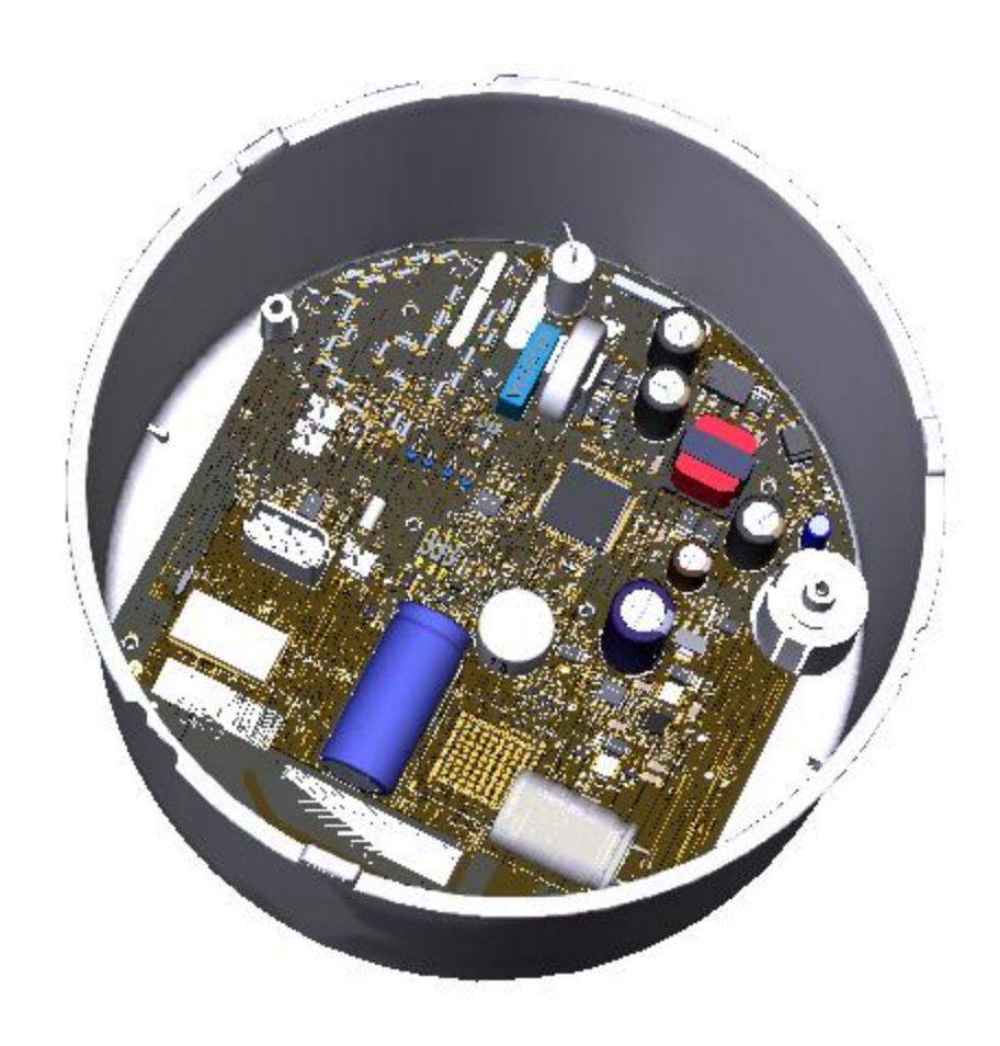
Figure 2. AXei PCB installation view