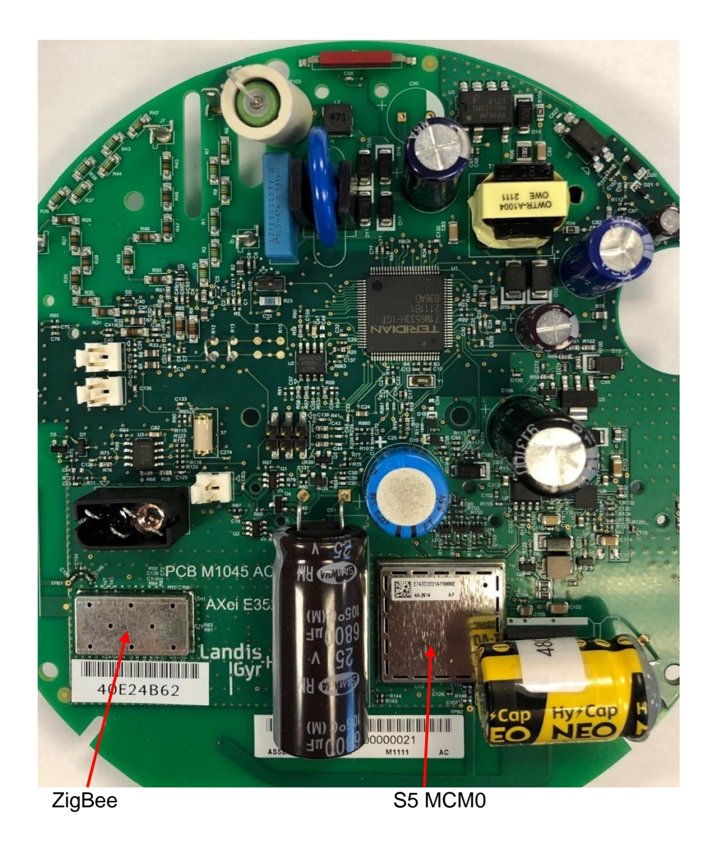
Figure 1. AXei PCBA