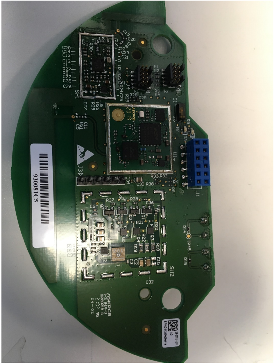
Figure 1: Top View