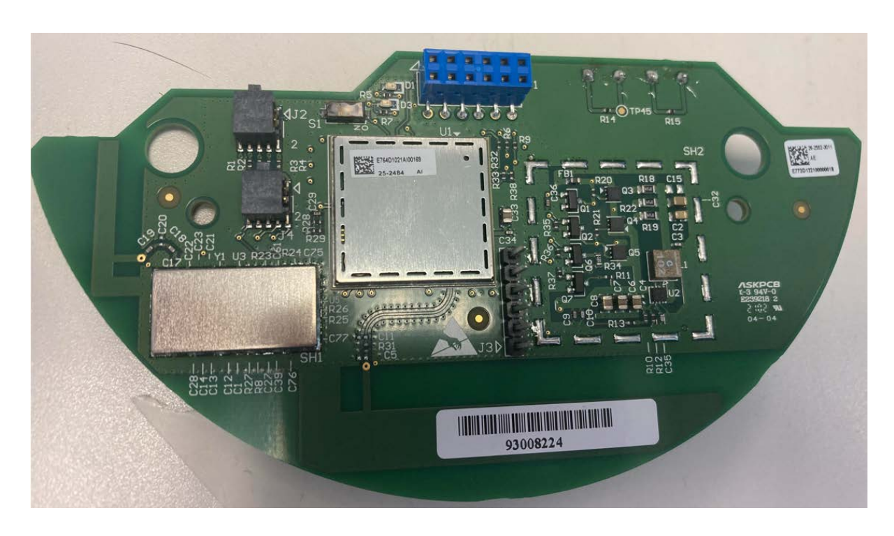
Figure 1: Top View