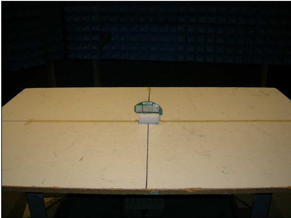
Figure 1: Radiated Emissions