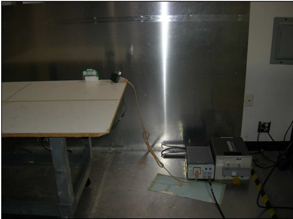
Figure 3: Conducted Emissions