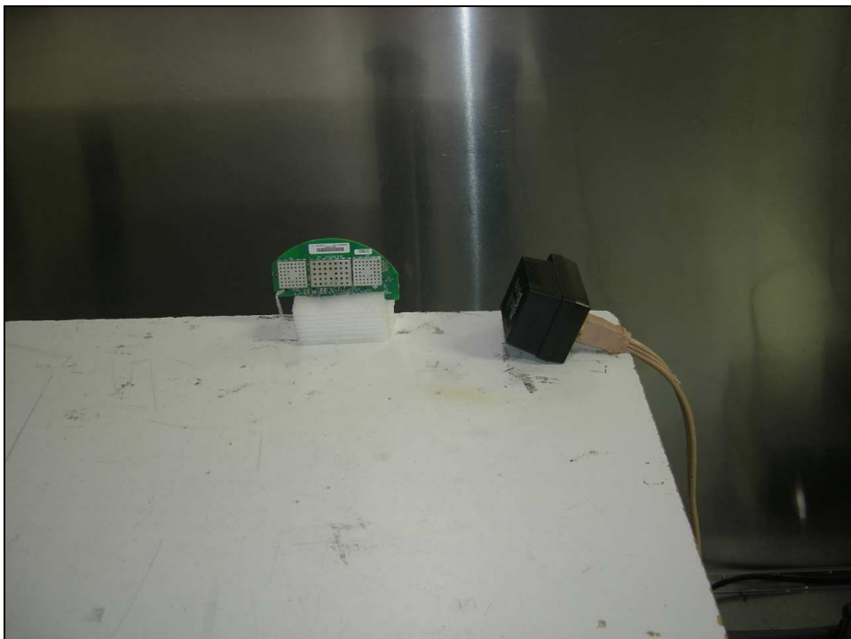
Figure 4: Conducted Emissions