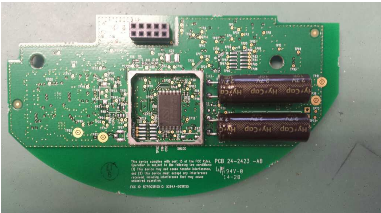
Figure 2: Internal Photo – Shields Removed