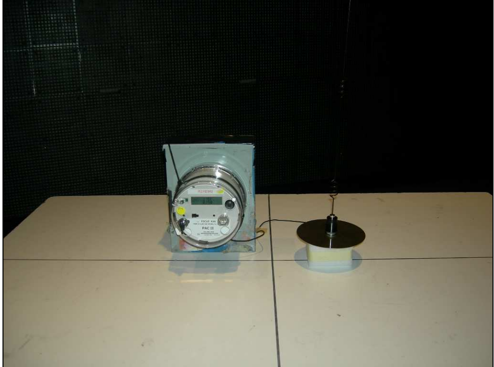
Figure 1: Radiated Emissions