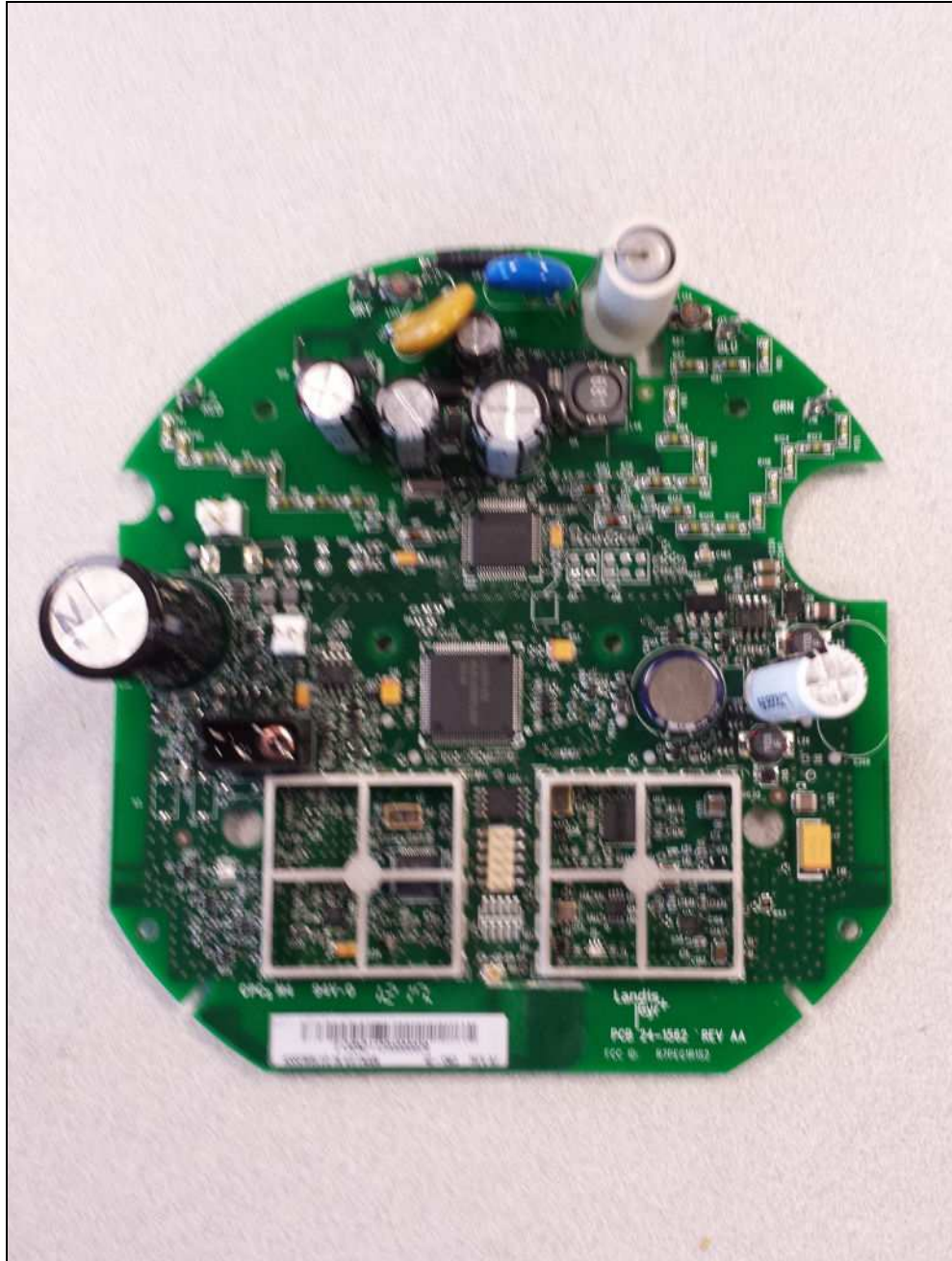
Figure 3: Internal Photo – PCB without Shields