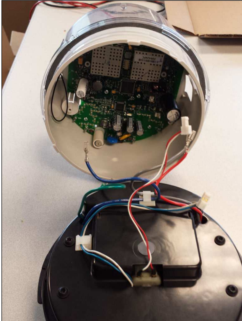
Figure 1: Internal Photo – Assembled View