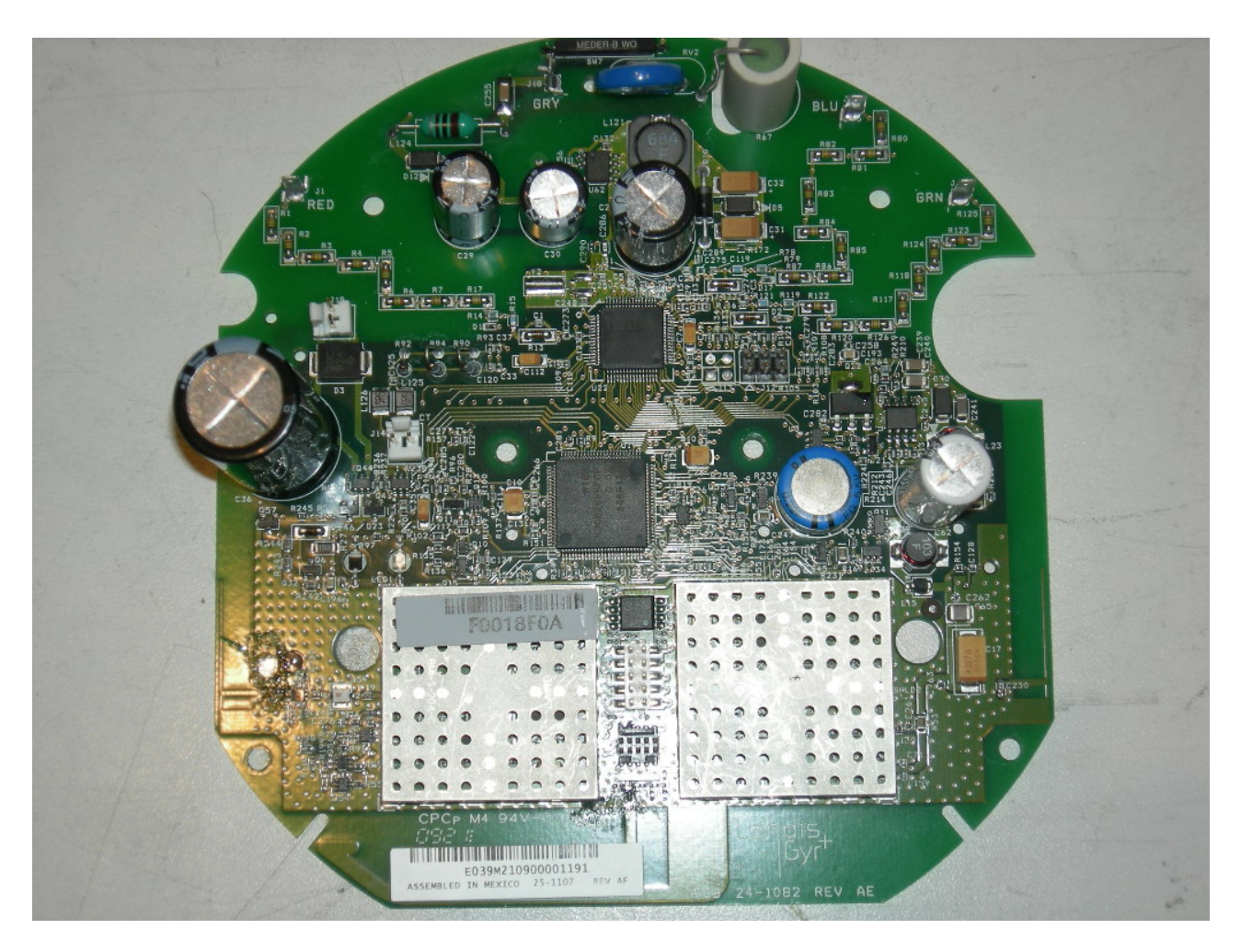
Figure 2: PCB with Shields - Front