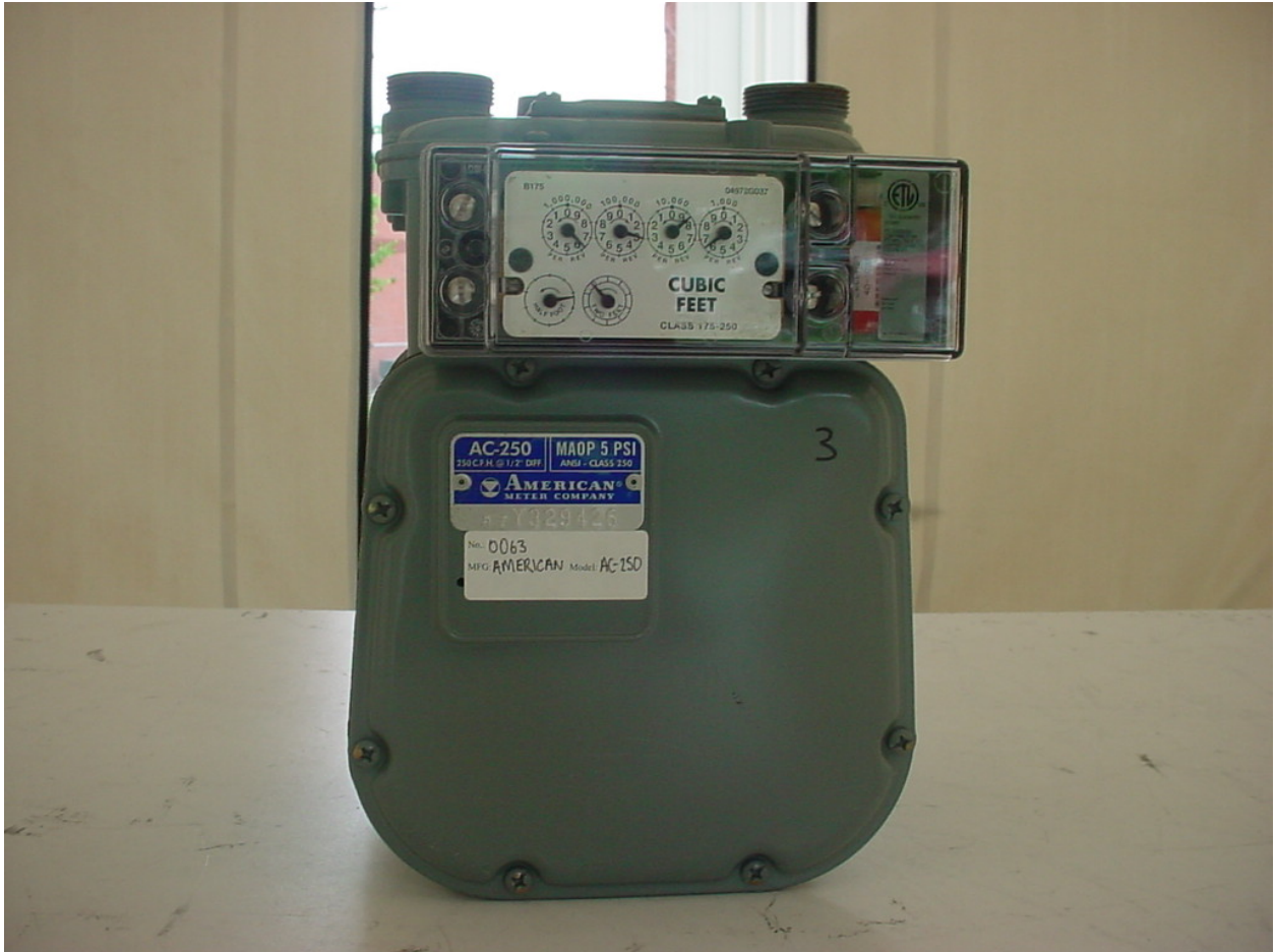
Figure 2: 25-1075 – Radiated Emissions