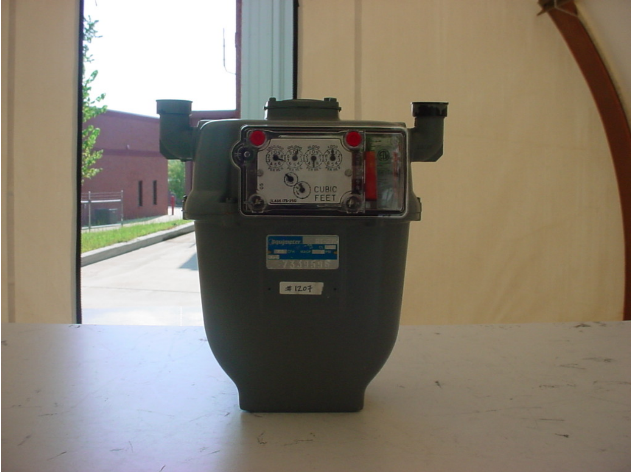
Figure 6: 25-1081 – Radiated Emissions