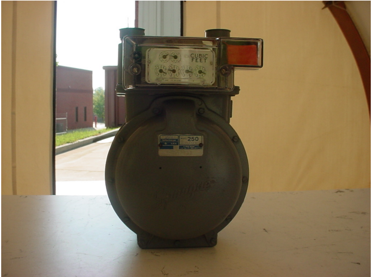
Figure 4: 25-1080 – Radiated Emissions