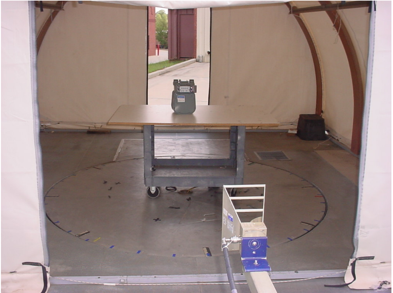
Figure 1: 25-1075 – Radiated Emissions