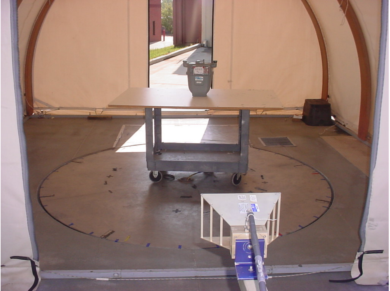
Figure 5: 25-1081 – Radiated Emissions