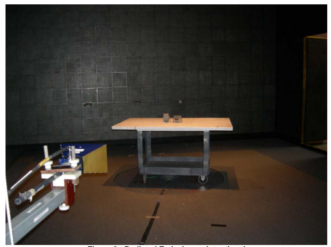
Figure 2: Radiated Emissions – Intentional