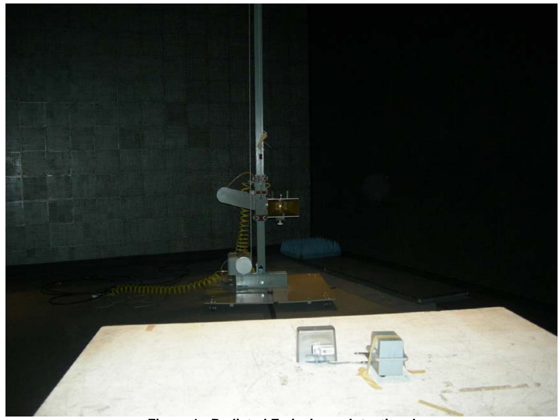
Figure 1: Radiated Emissions - Intentional