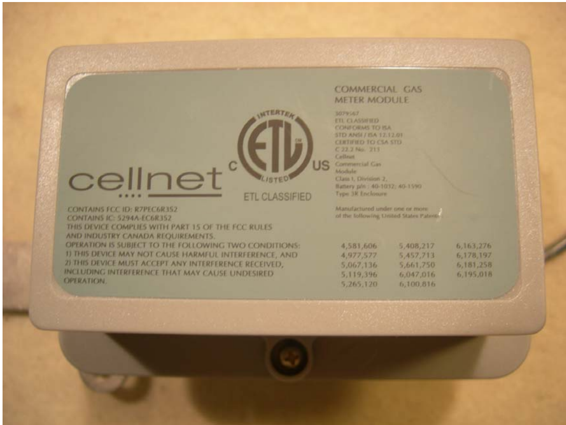
Figure 3: Host Label