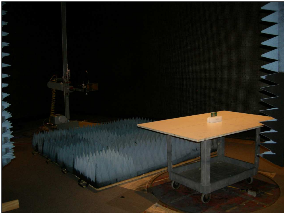
Figure 3: Radiated Emissions