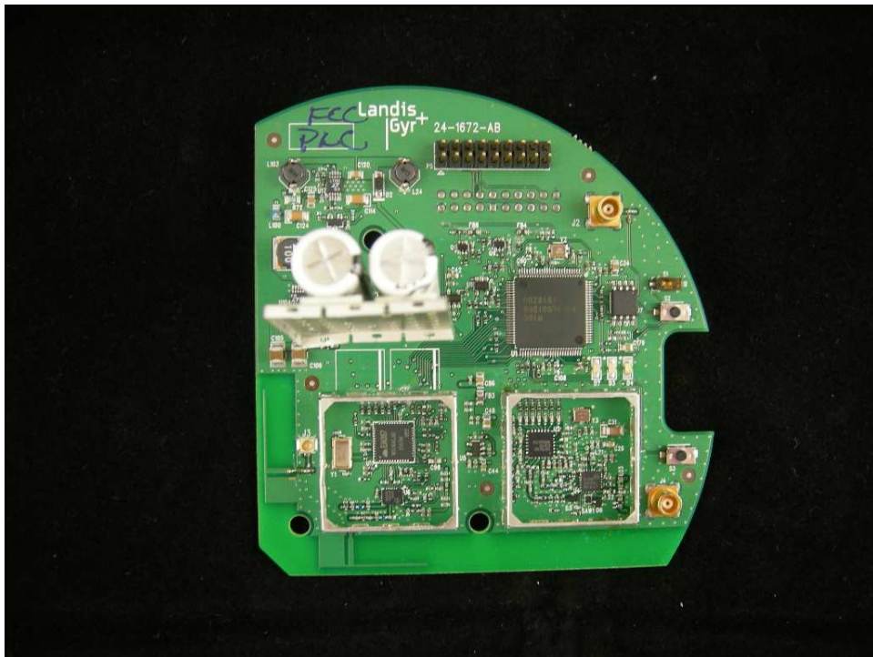
Figure 1: Internal Photo – Shields Removed