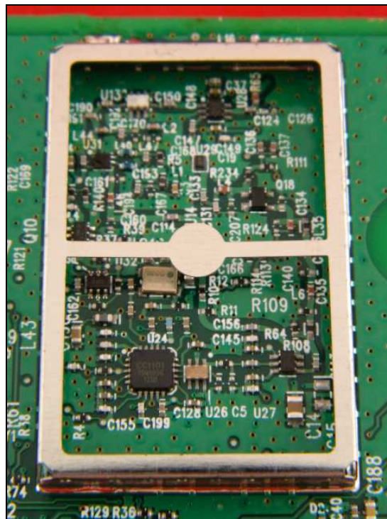
Figure 2: Internal Photo – Shield Removed