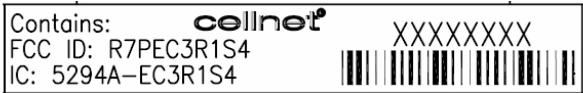
Figure 3: Label Information – Host Sample Label