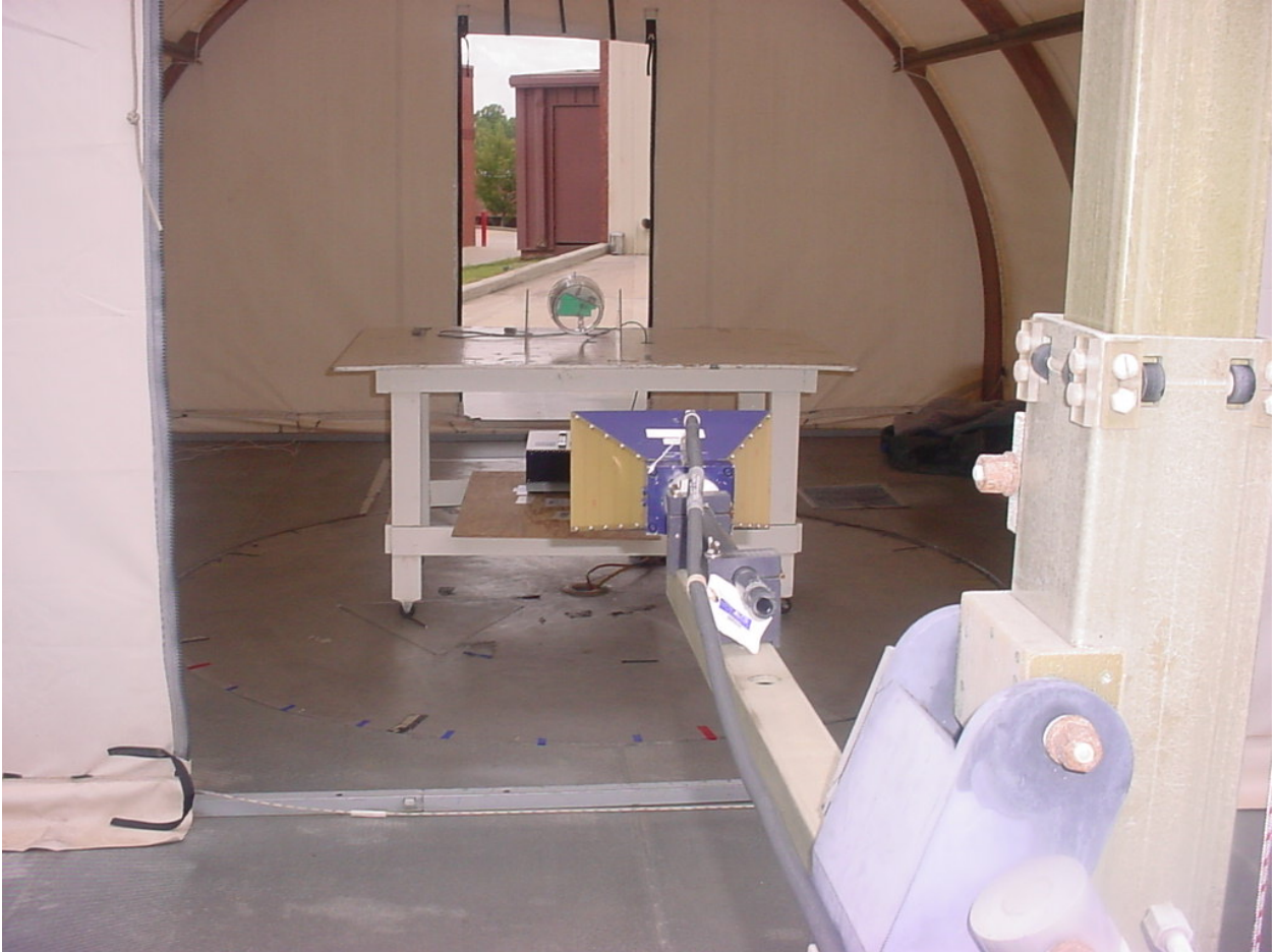
Figure 2: Test Setup - Radiated Emissions – Intentional