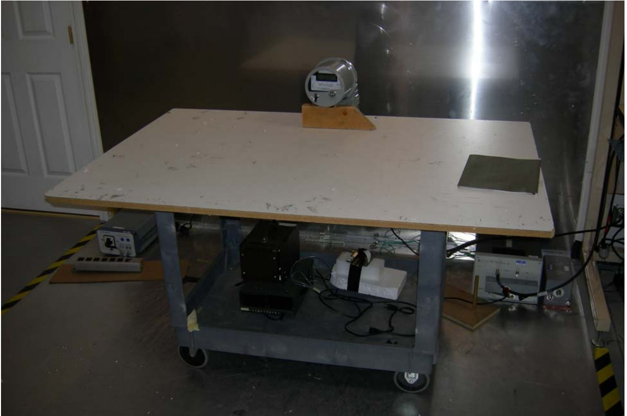
Figure 5: Test Setup – AC Power Line Conducted Emissions