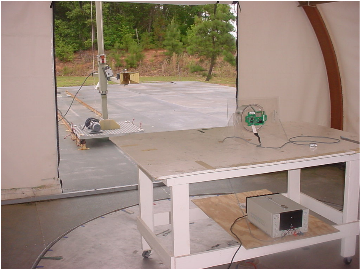
Figure 1: Test Setup - Radiated Emissions – Intentional