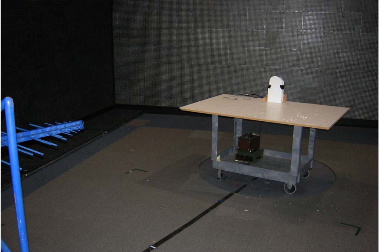
Figure 4: Test Setup - Radiated Emissions – Unintentional