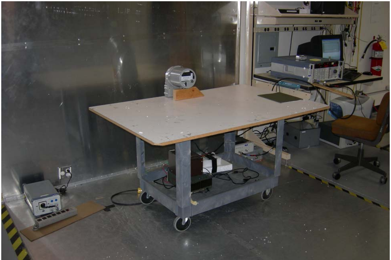
Figure 6: Test Setup – AC Power Line Conducted Emissions