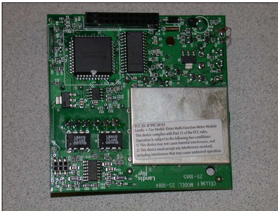
Figure 2: Label Placement