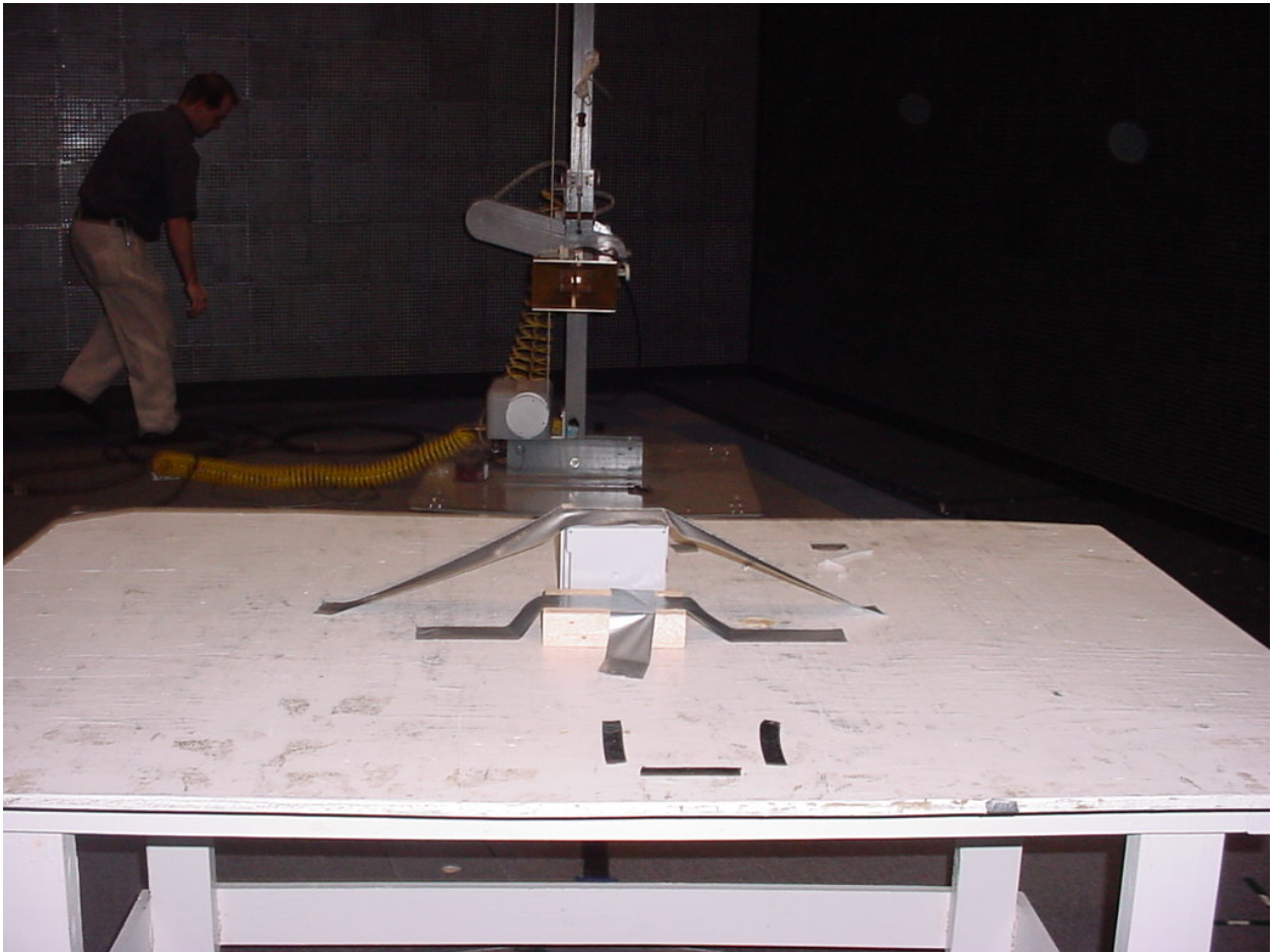
Figure 2: Test Setup – Radiated Emissions