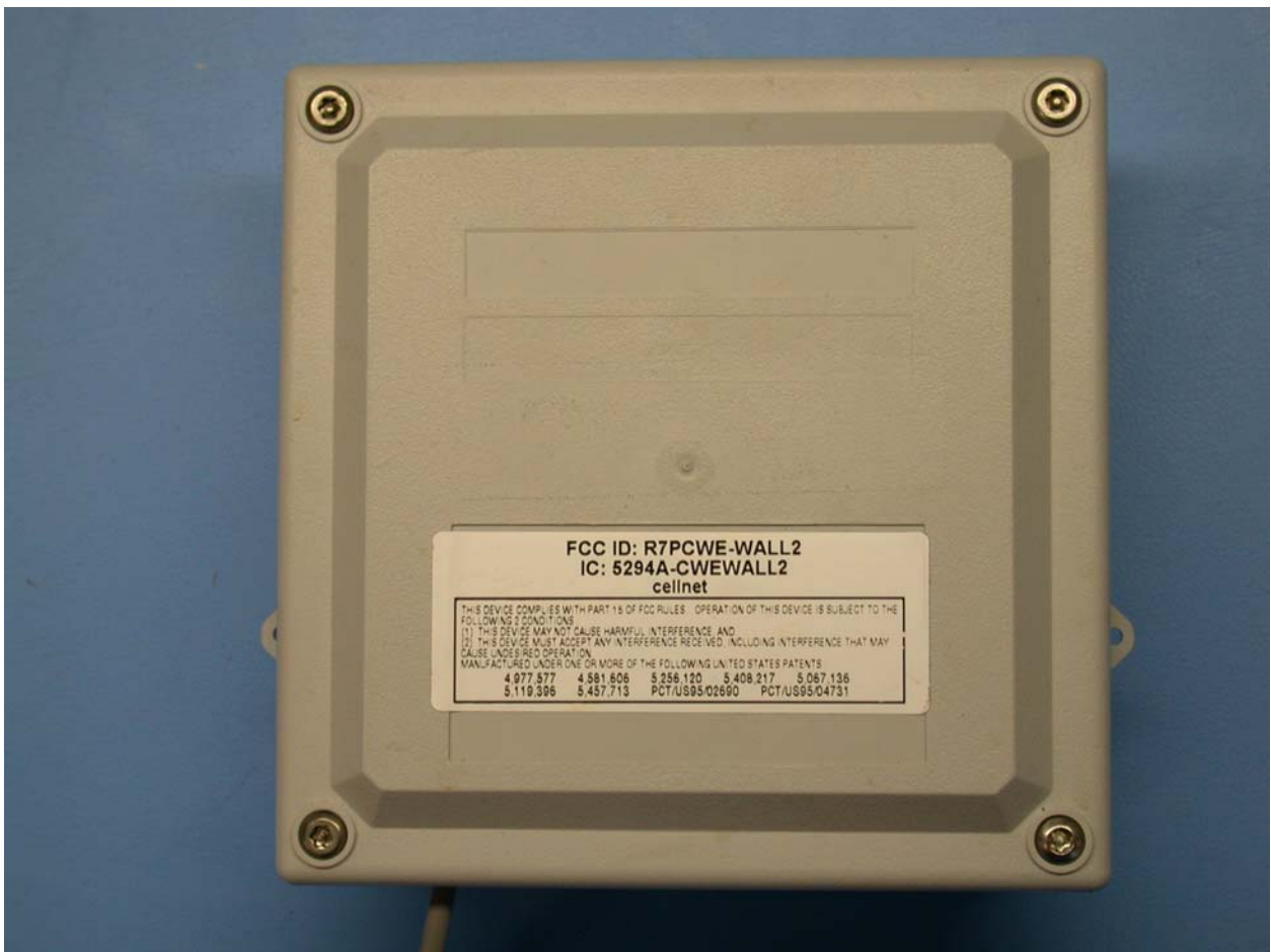
Figure 2: Label Location