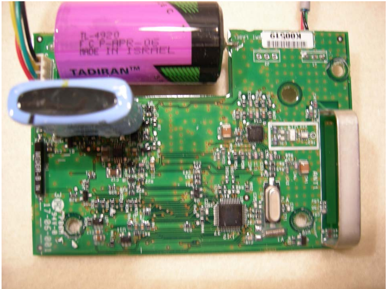
Figure 2: Internal – Top View - PCB