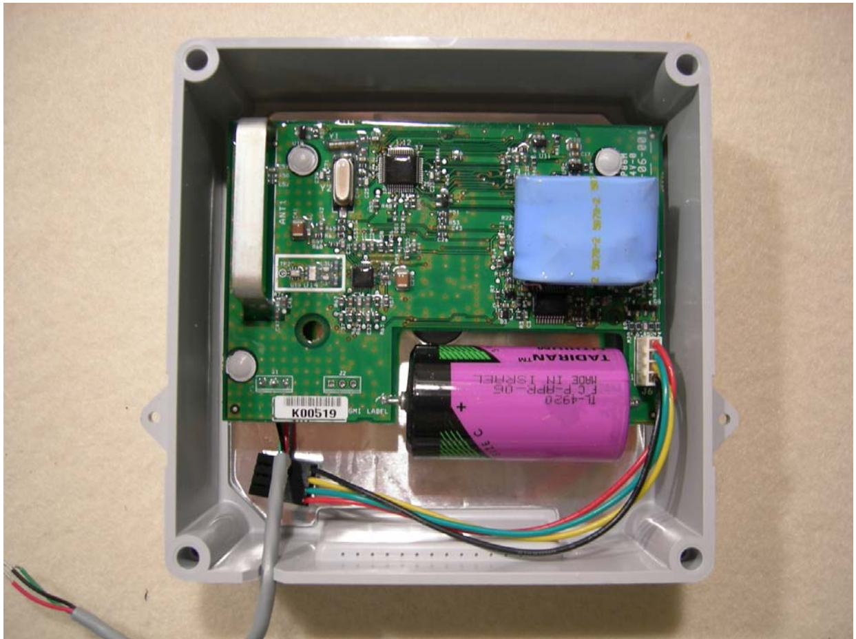
Figure 1: Internal – Top View - Assembled