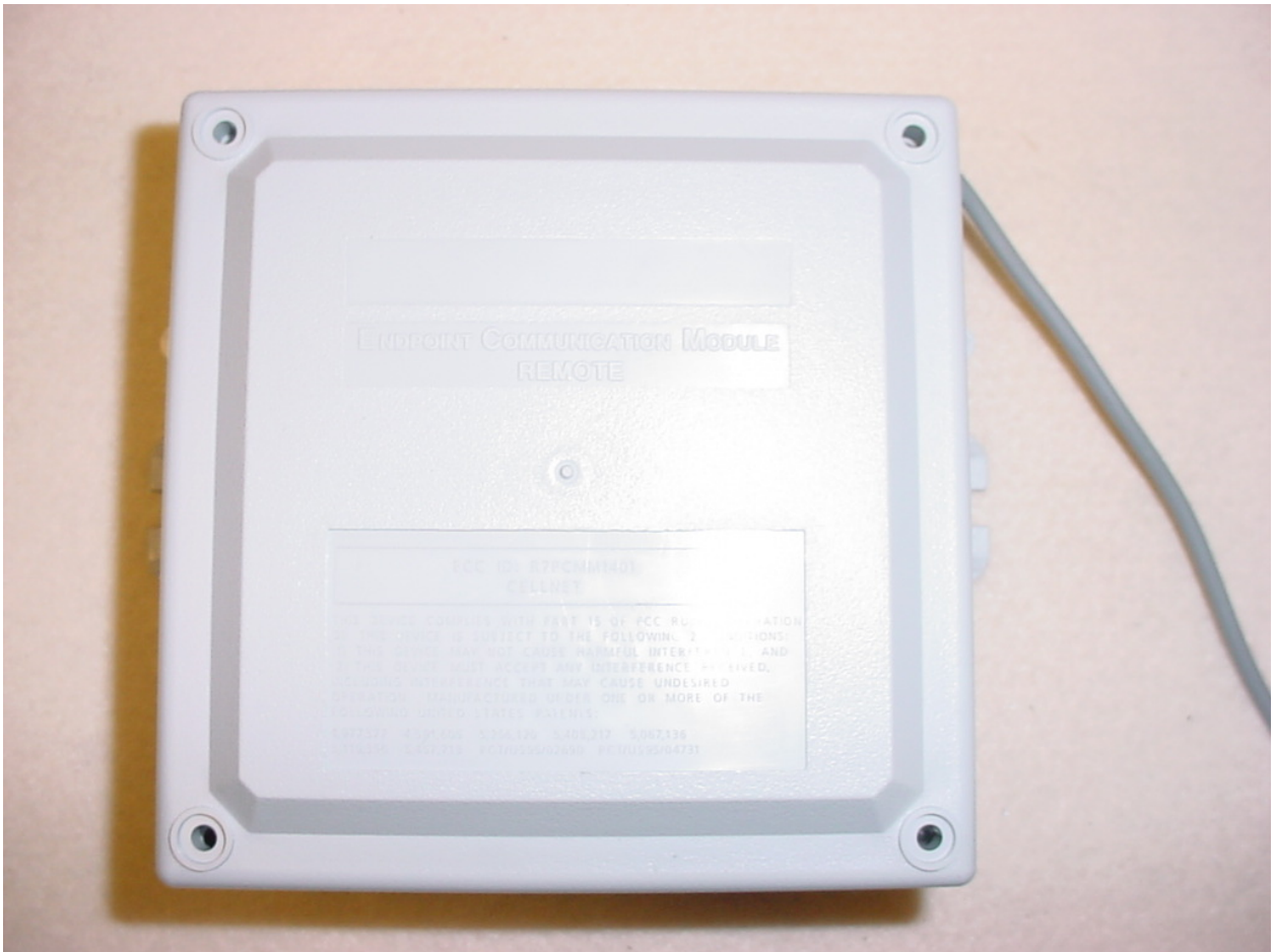
Figure 1: External – Top View