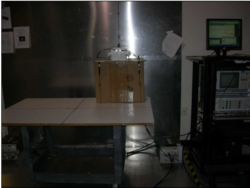
Figure 3: Conducted Emissions