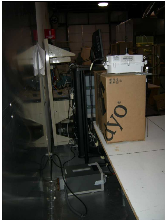
Figure 4: Conducted Emissions