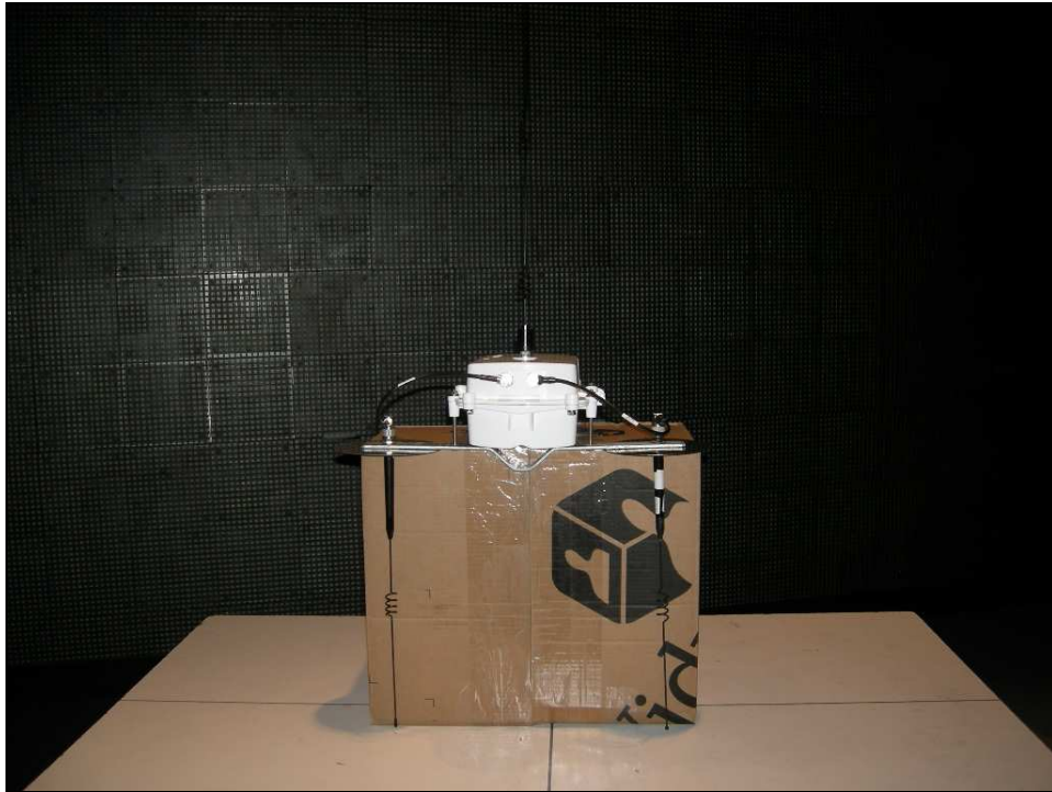
Figure 1: Radiated Emissions