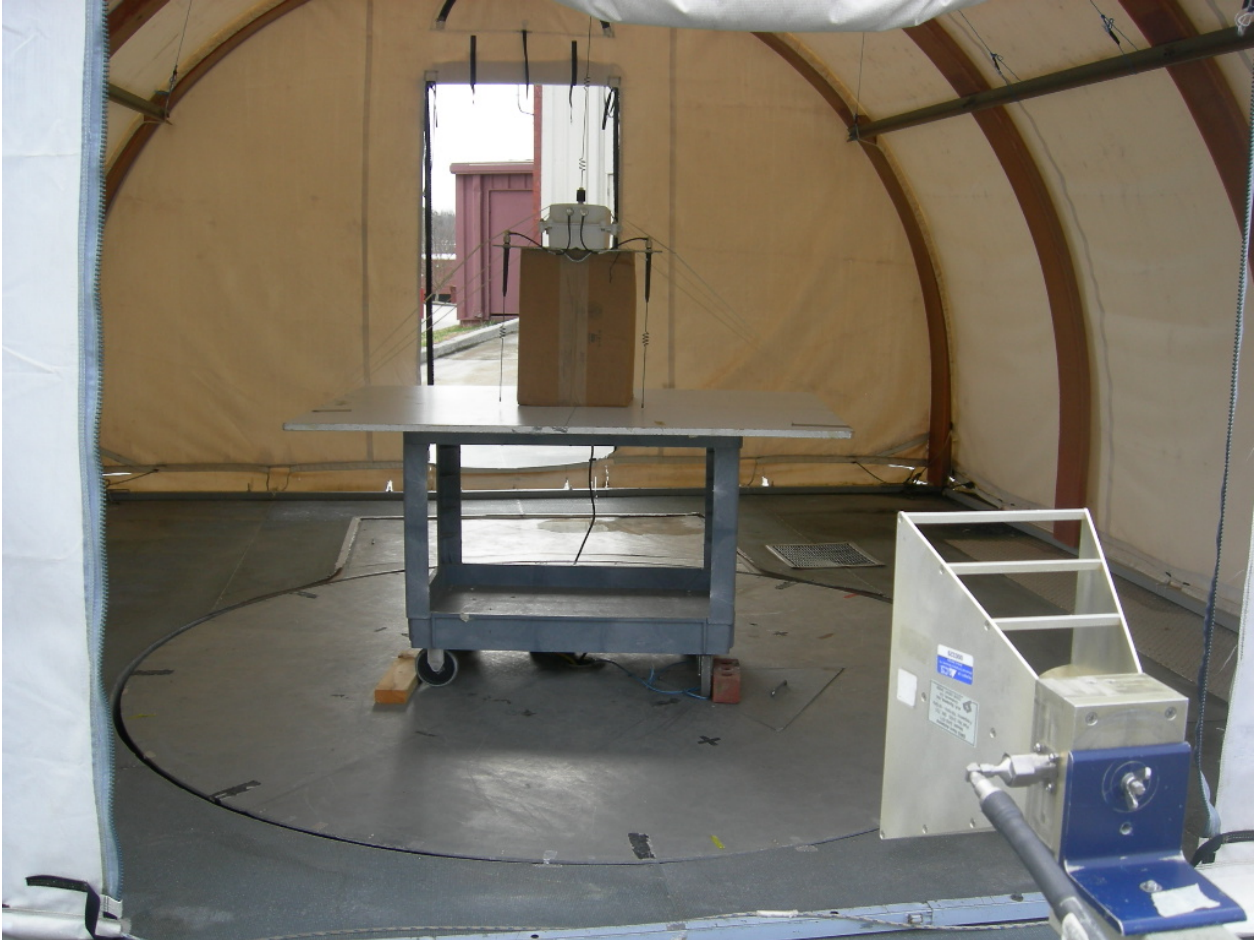
Figure 2: Radiated Emissions