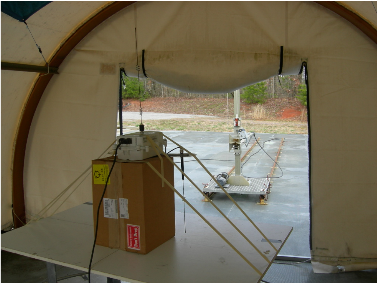
Figure 1: Radiated Emissions