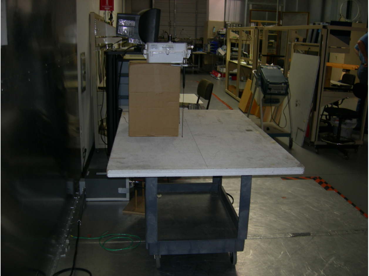
Figure 4: AC Power Line Conducted Emissions