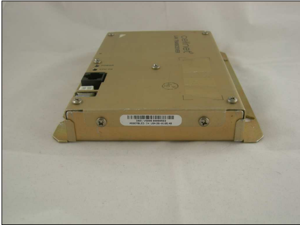
Figure 5: External Photo – Side