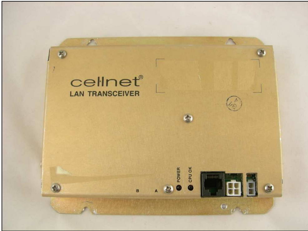
Figure 1: External Photo – Top