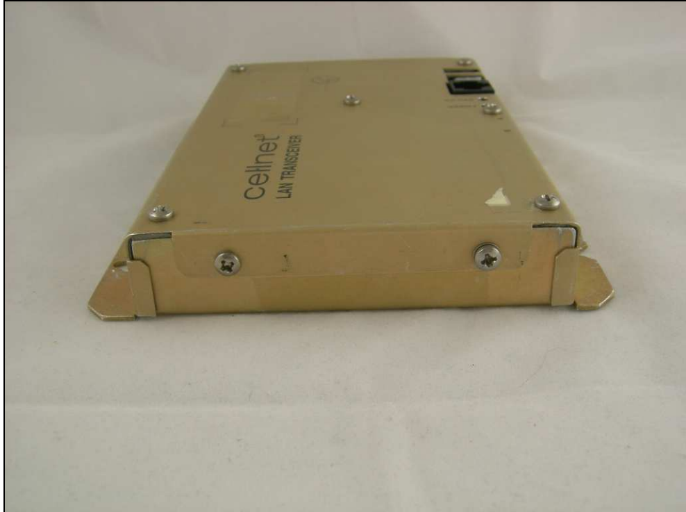
Figure 6: External Photo – Side