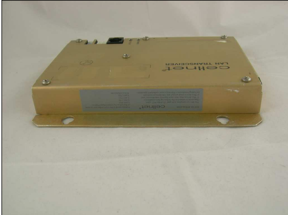
Figure 4: External Photo – Back