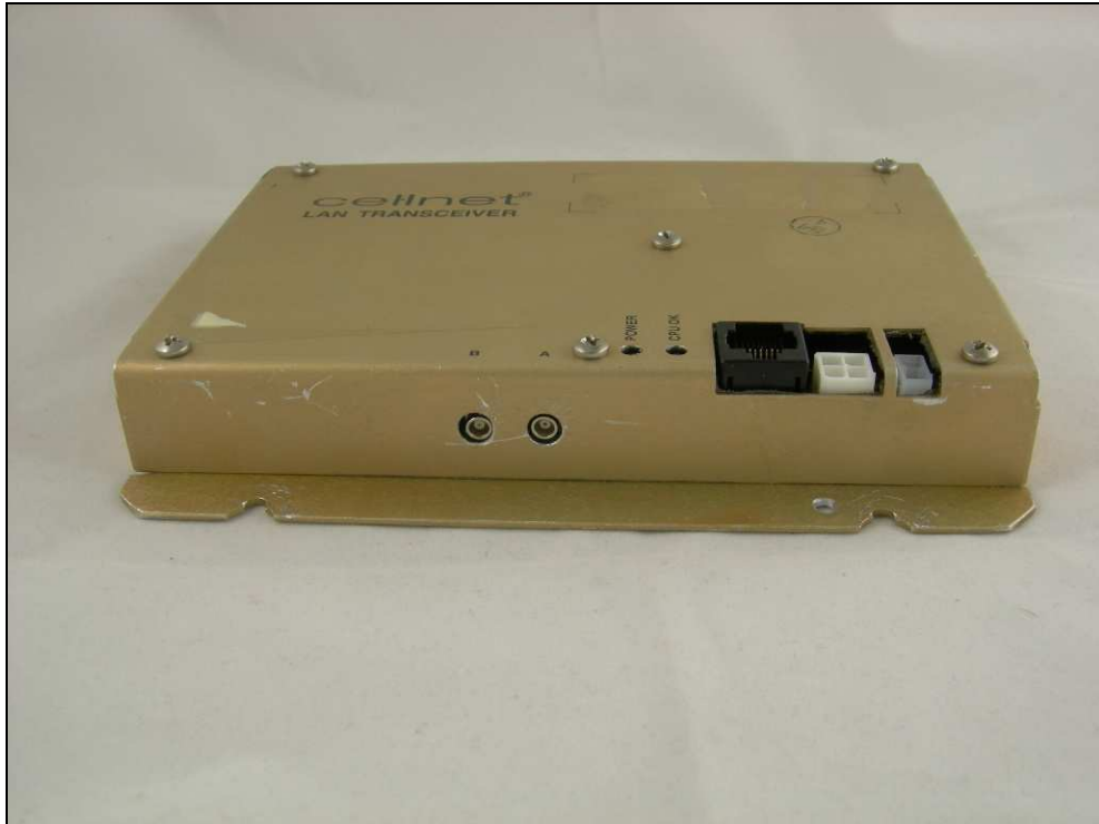
Figure 3: External Photo – Front