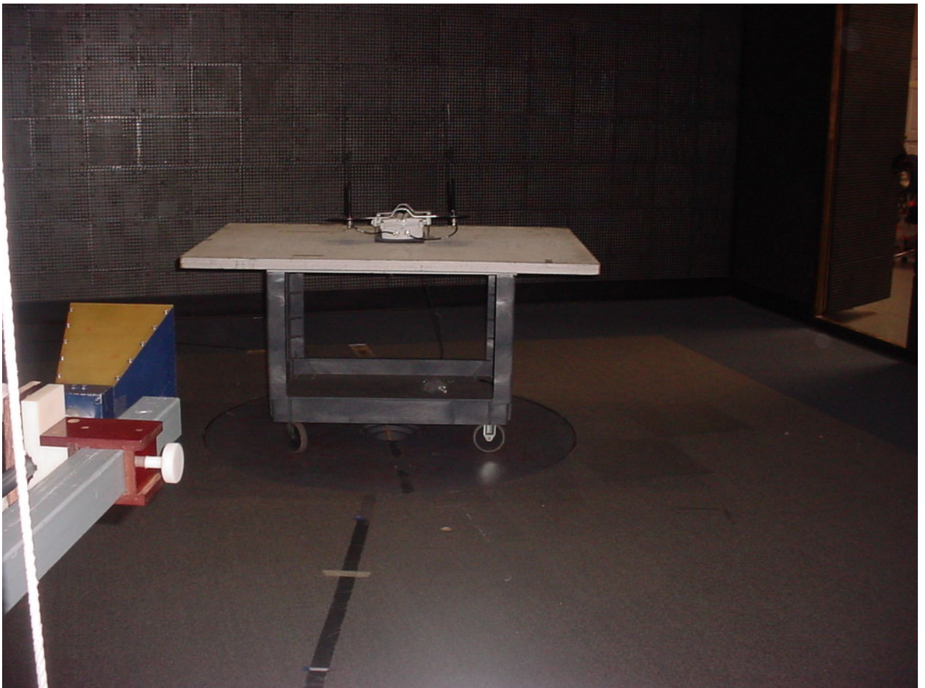
Figure 1: Test Setup – Radiated Emissions