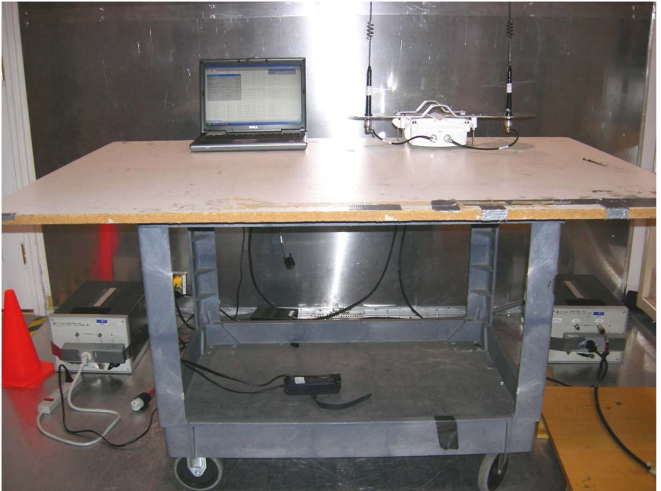
Figure 3: Test Setup – Conducted Emissions