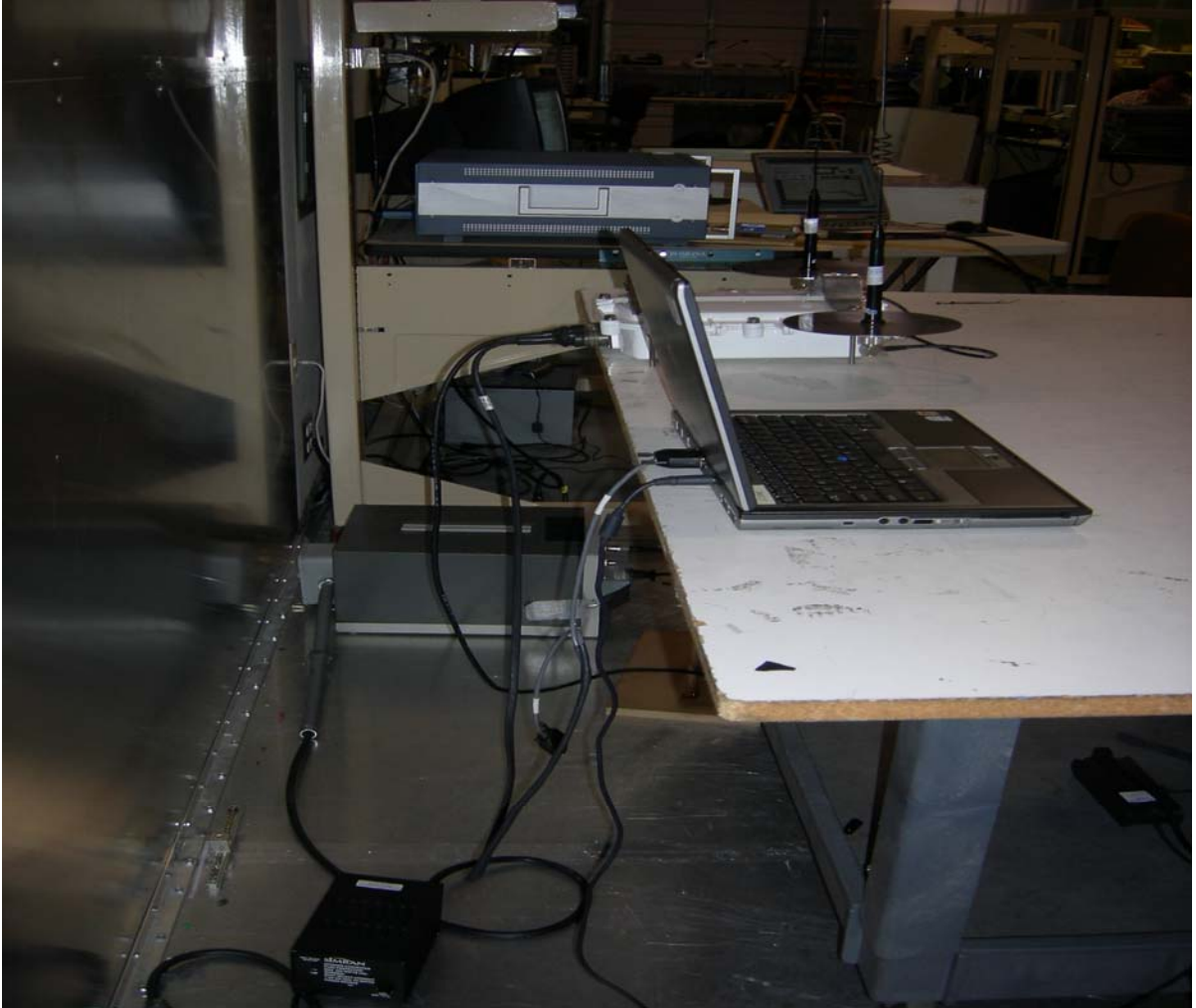
Figure 4: Test Setup – Conducted Emissions