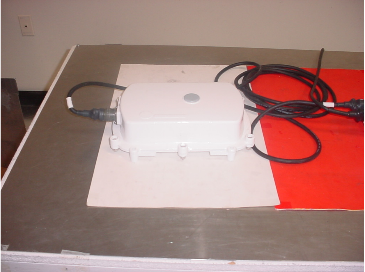
Figure 3: External – InfiNet Concentrator Battery Pack