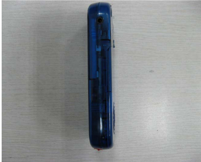
The right side of the sample