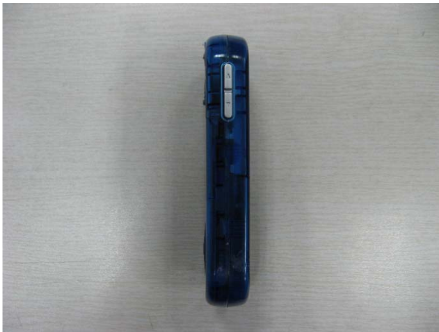
The left side of the side