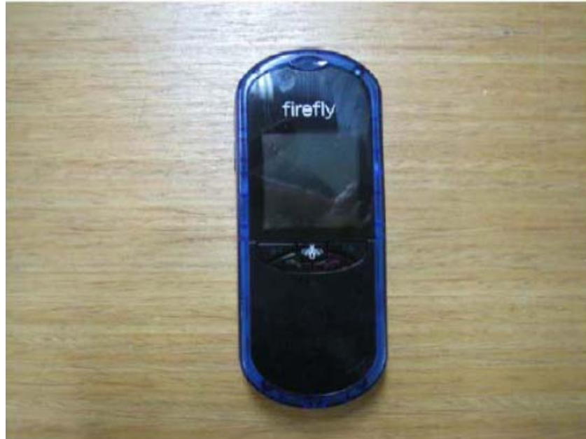
Front view of the sample