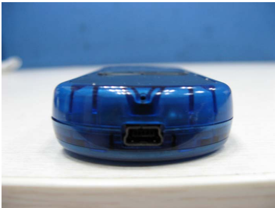
The bottom of the side