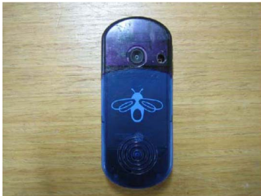
Back view of the sample