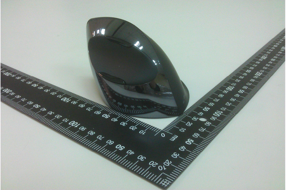
< Rear view of EUT >