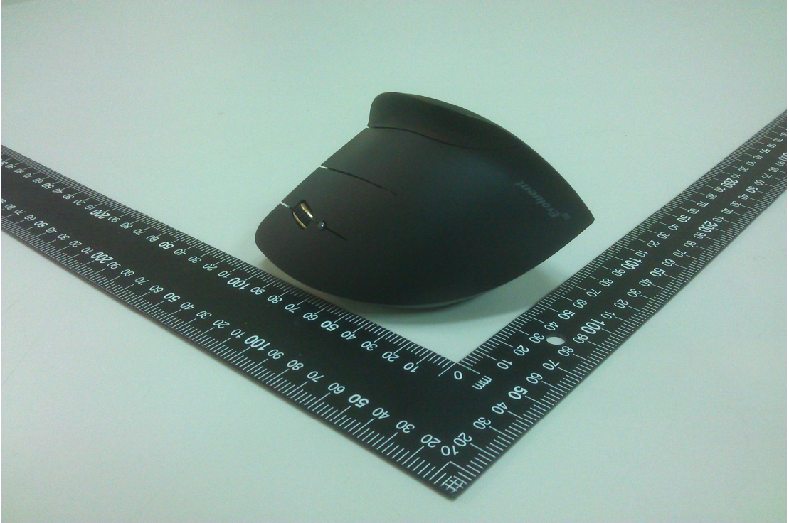
< Rear view of EUT >