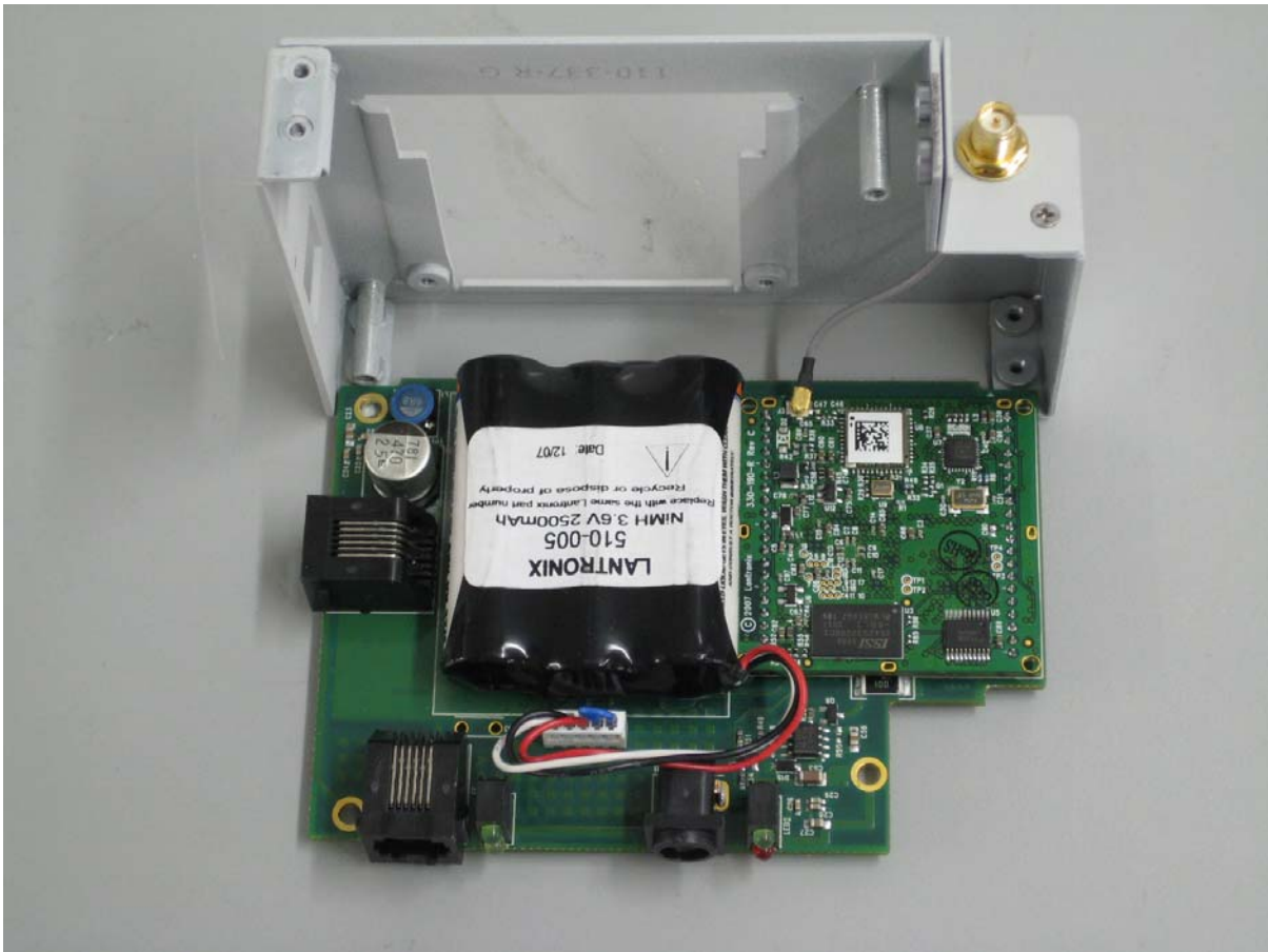
Top View of Circuit Board “Bottom Cover Removed”