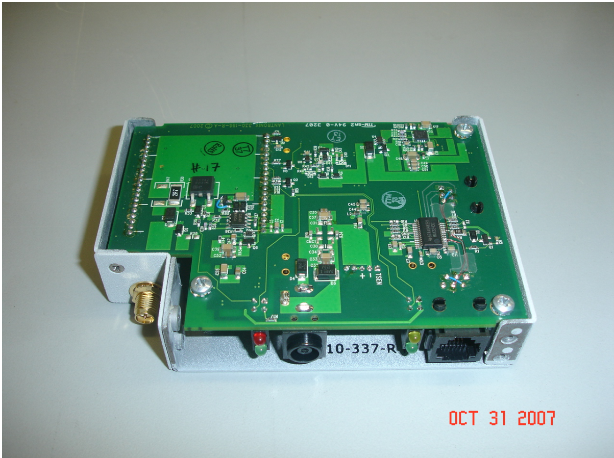
Bottom View of Circuit Board “Top Cover Removed”