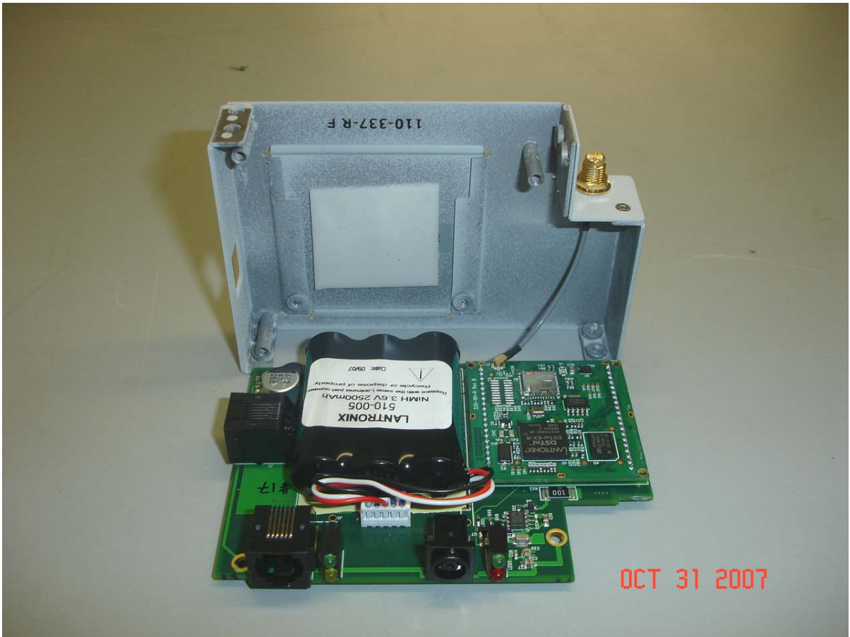
Top View of Circuit Board “Bottom Cover Removed”