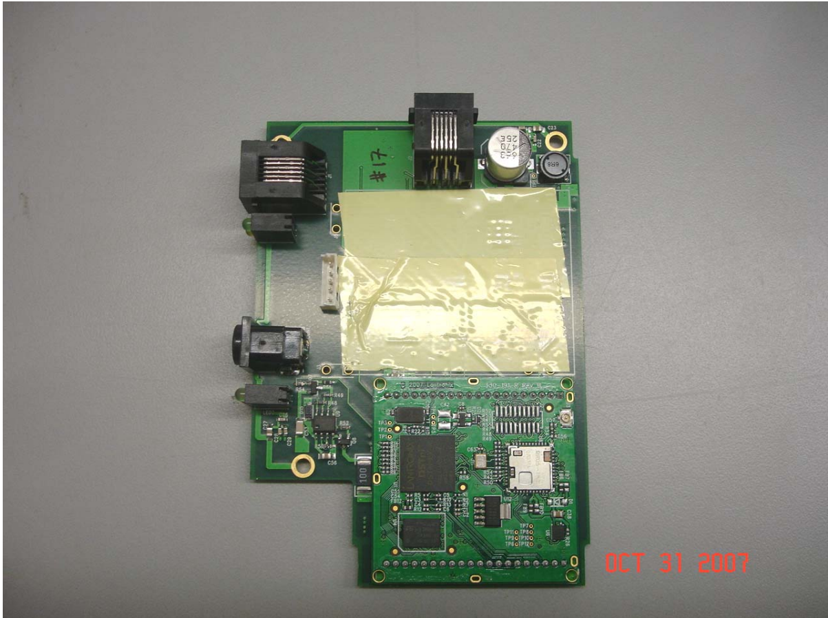
Top View of Circuit Board “Battery & Antenna Port Disconnected”