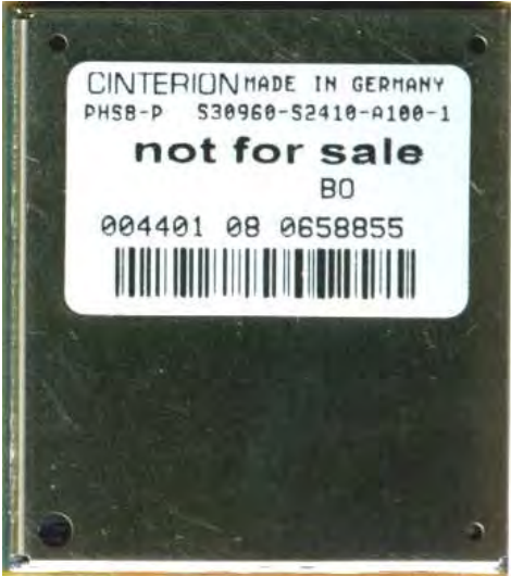
PHS8-P Top side