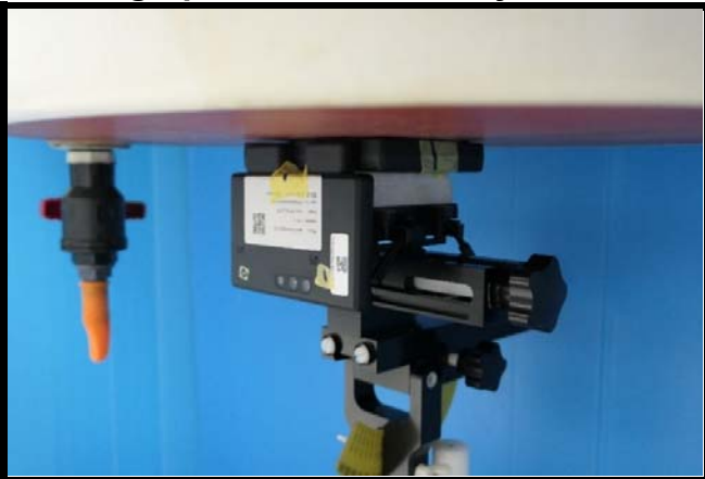
Bottom of EUT Tested at 0 mm